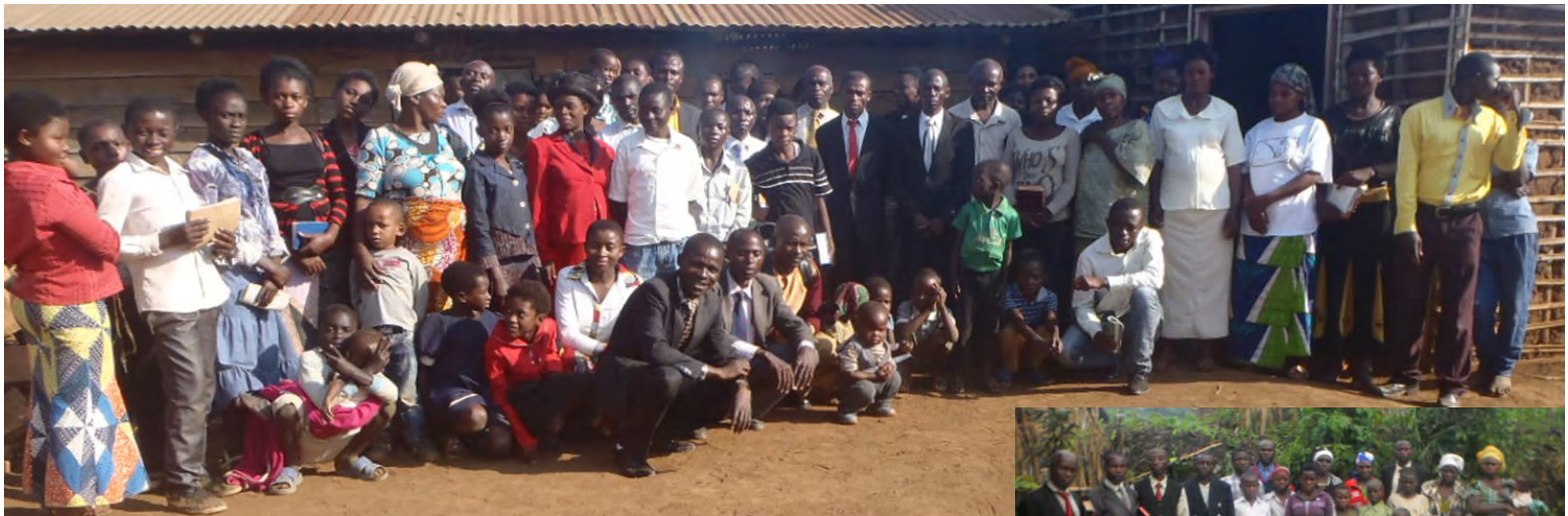
Above: Seminar in Bukavu, August 28, 2016