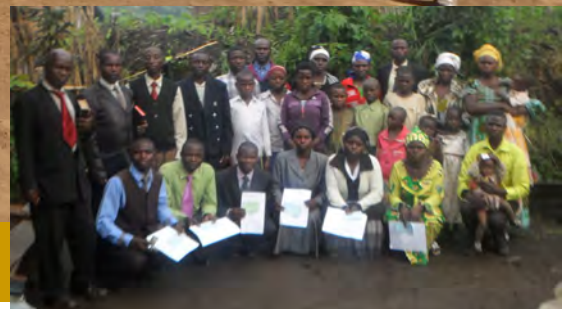
Right: Visitors and members following baptism in East Masisi