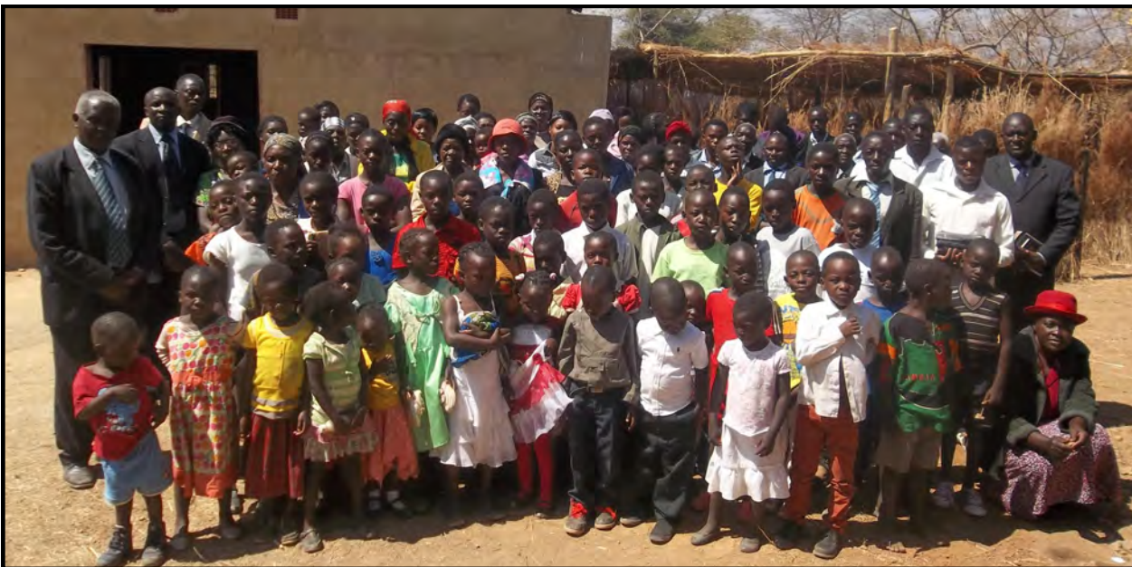
Monze Camp Meeting, Zambia