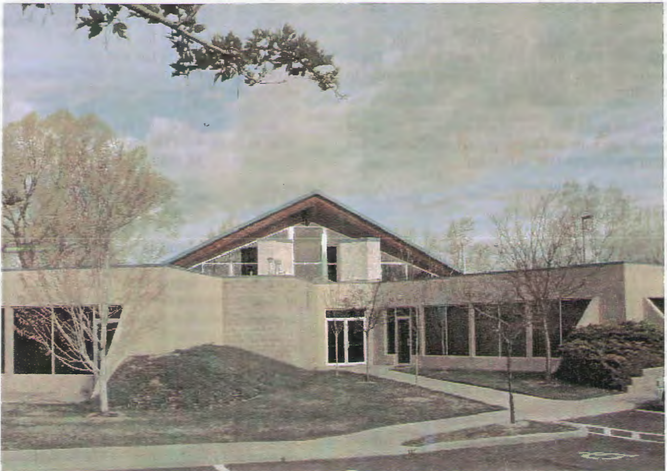
Our Church building in Denver Colorado.

From the beginning of "Your Bible and You"