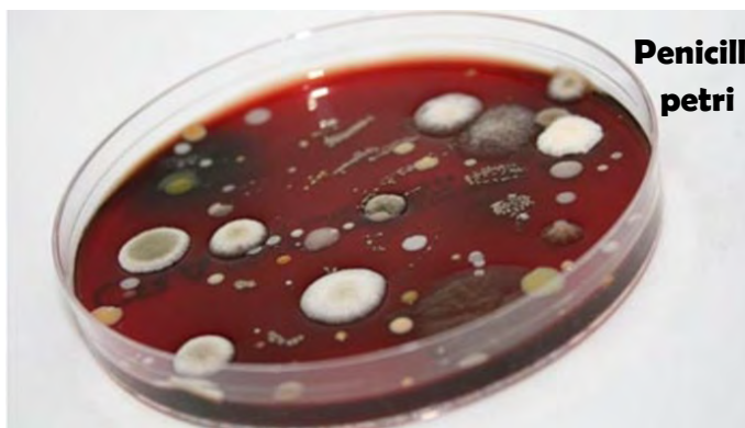
Penicillin in petri dish

In 1928, a Scottish scientist named Alexander Fleming made a discovery that would change the world. He noted that a specific blue-green mould was attacking and killing bacteria contained in a petri dish in his lab. This mould, identified as penicillium notatum , revolutionized medicine and treatment of bacterial infections. Penicillin was the first antibiotic discovered; and, for the first time