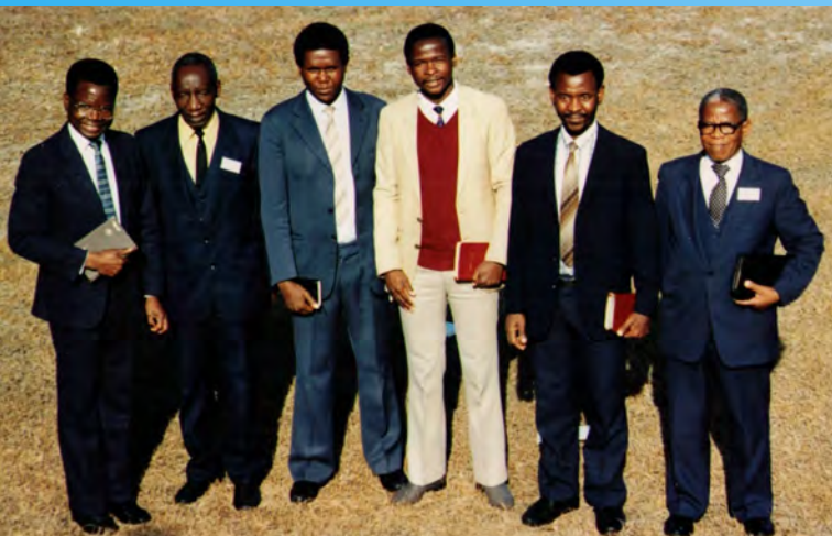
Left: Leaders in Africa send greetings to those who attended the Commemo- ration.