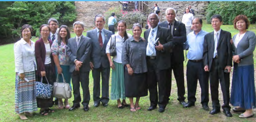
Left: Believers from Asia