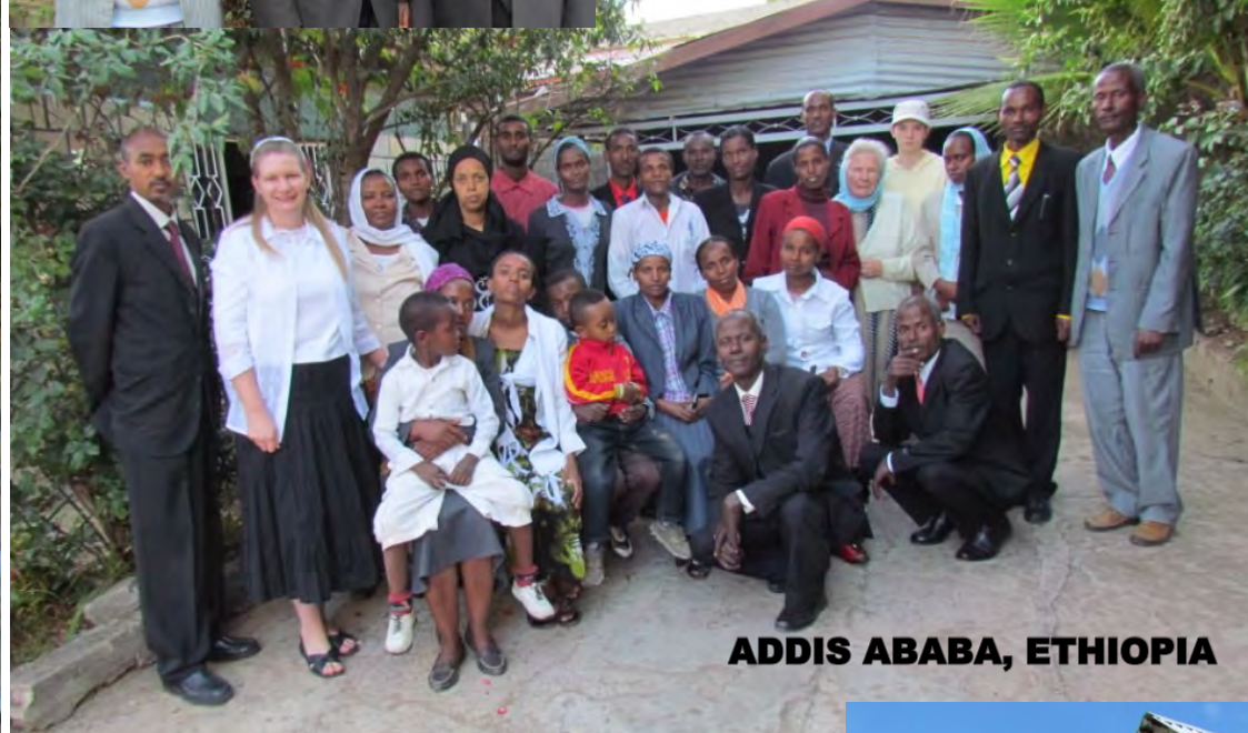
ADDIS ABABA, ETHIOPIA