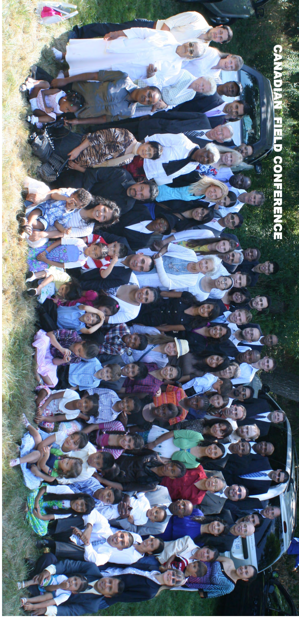
CANADIAN FIELD CONFERENCE