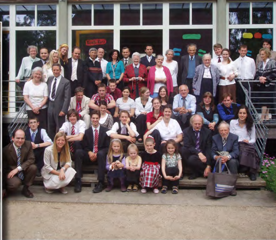
Youth Sabbath in Nürnberg, Germany