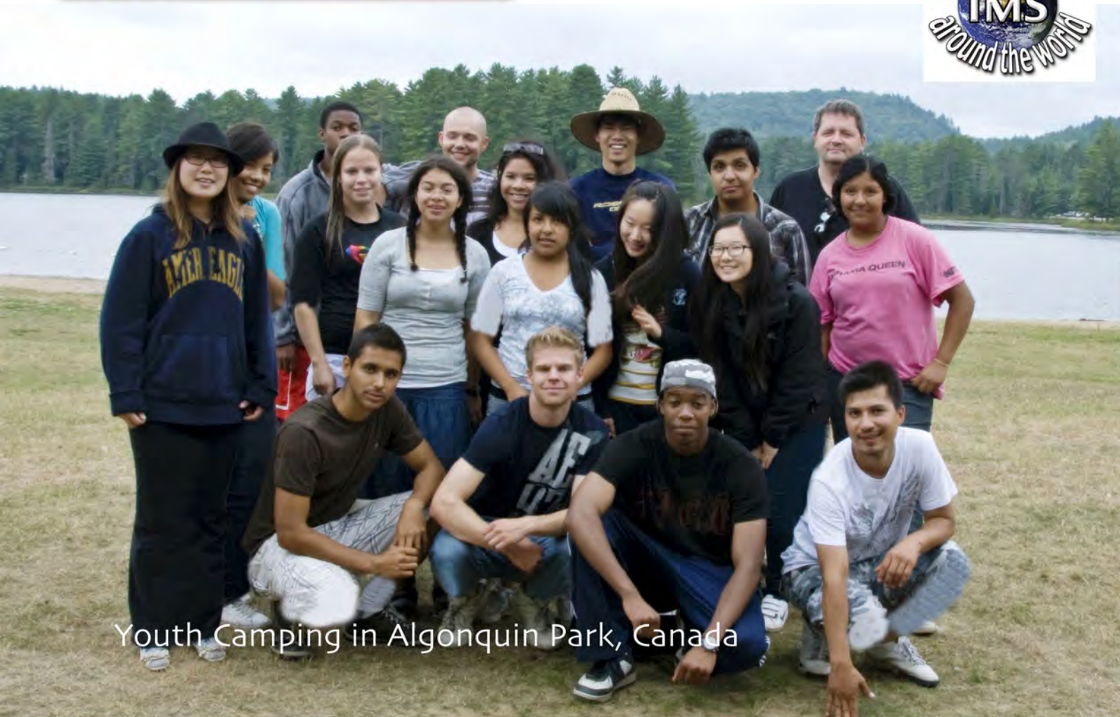
Youth Camping in Algonquin Park, Canada