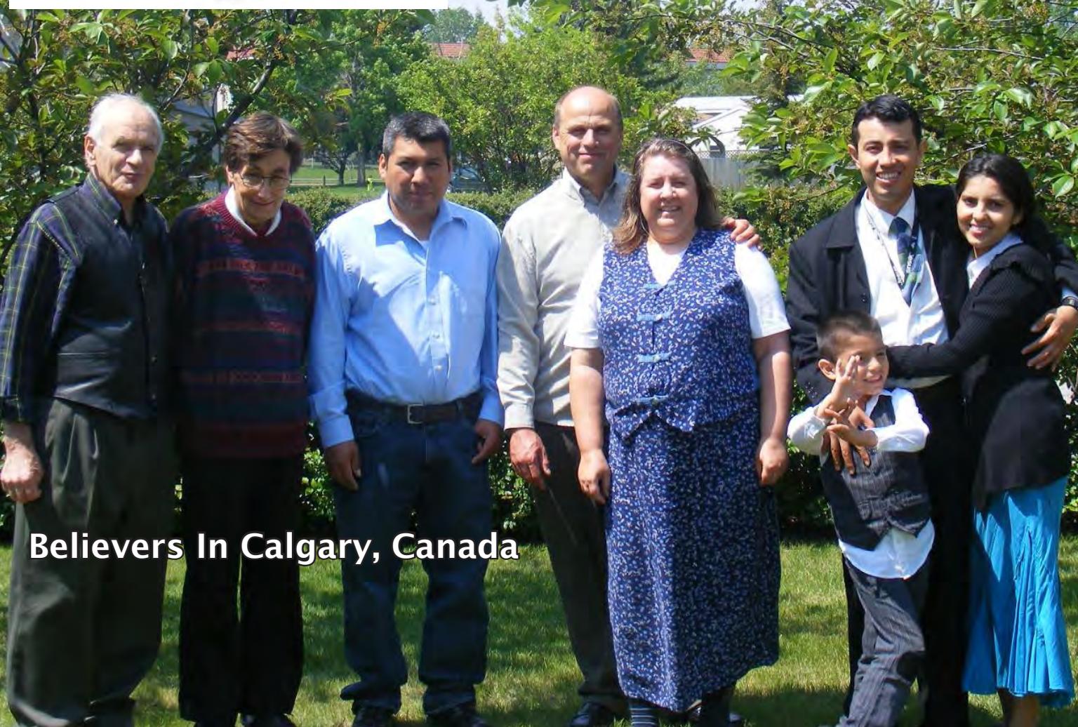
Believers In Calgary, Canada

this not practically seen? The small house we had as a shelter had filled completely; others even returned only to come back in the afternoon. The people there are humble; imagine they had to sit on the wet ground since the grass thatched house had leaked quite a lot! May the following promise be to their uplifting: