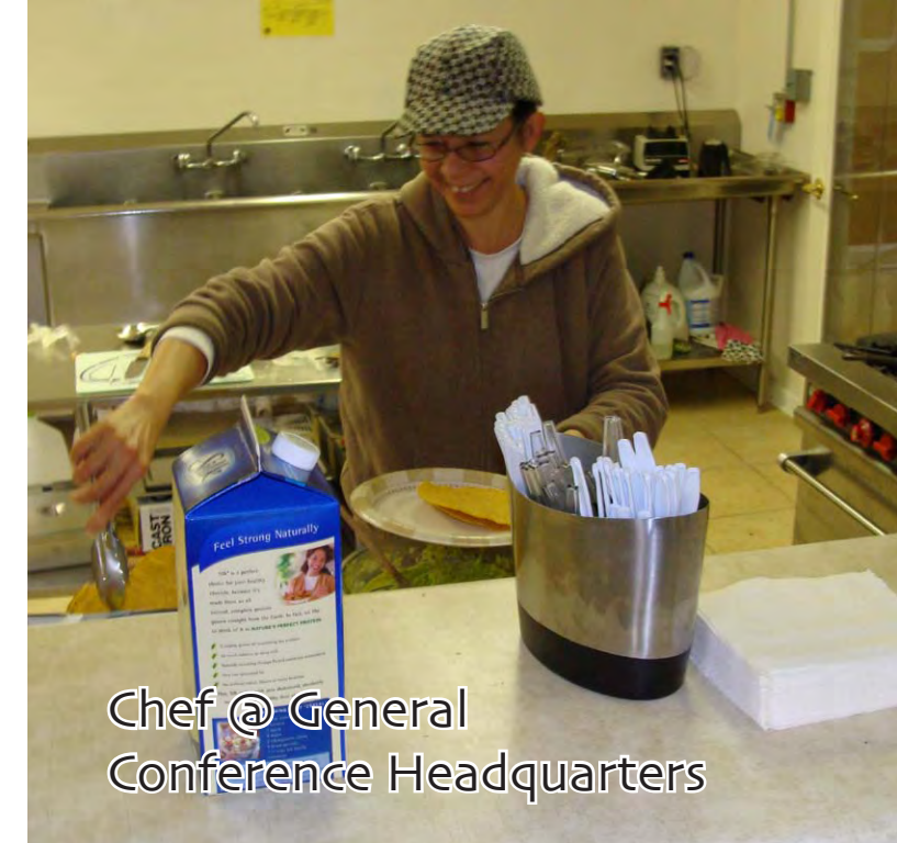
Chef @ General Conference Headquarters