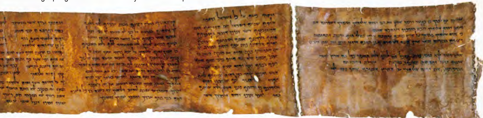
One of the Oldest Known Copies of the Ten Commandments