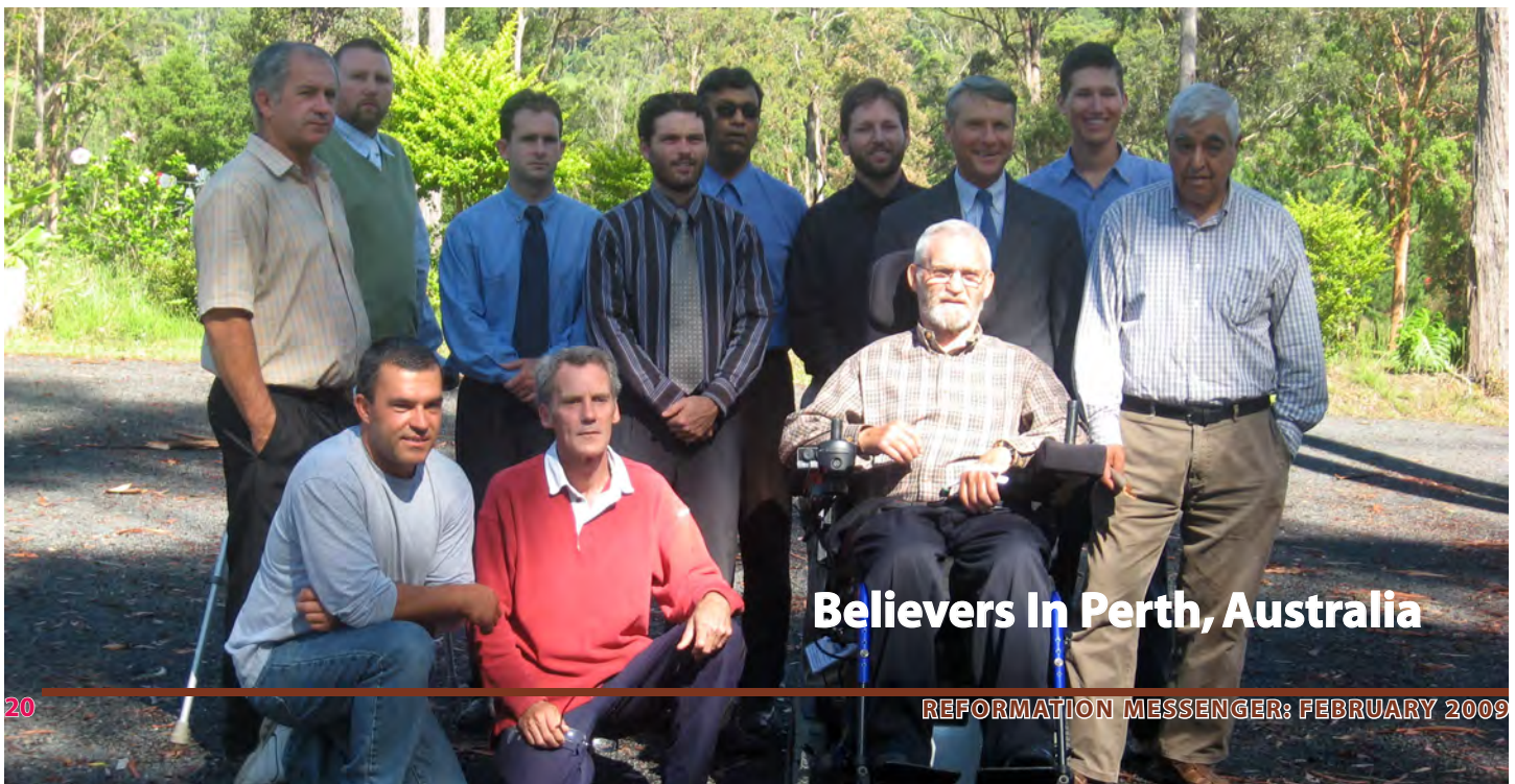
Believers In Perth, Australia