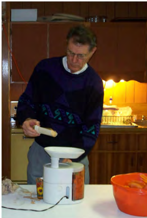
Cooking Class In Hamilton, Canada