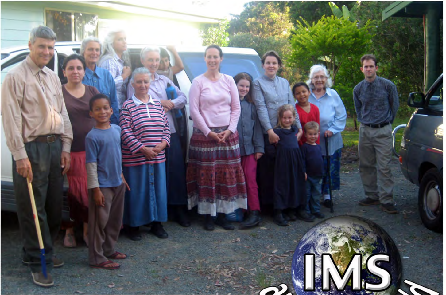
Believers In Perth, Australia