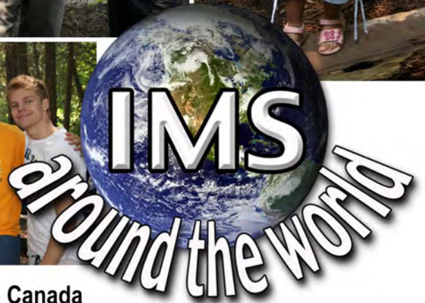
Church Picnic, Toronto, Canada