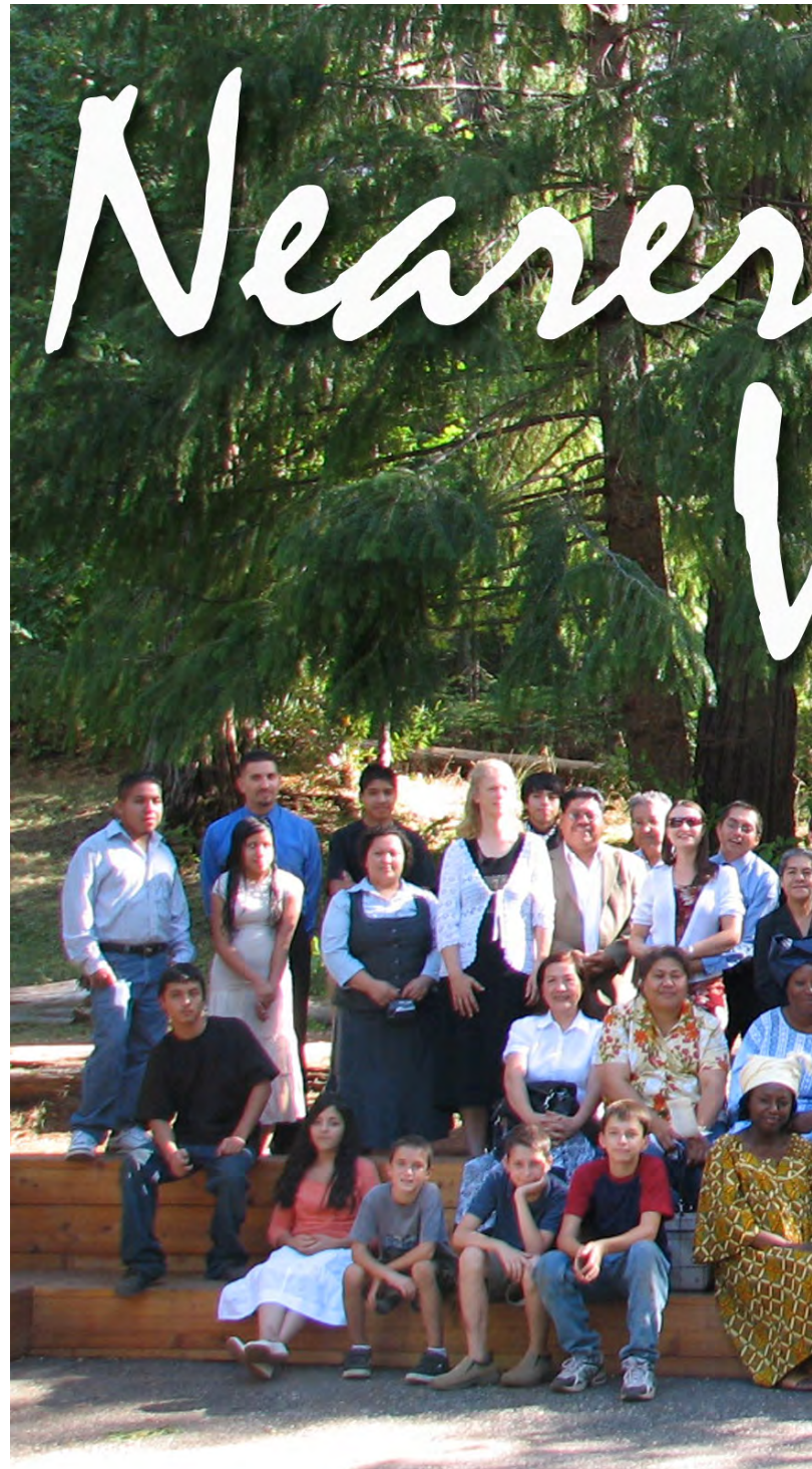
WESTERN FIELD CONFERENCE, CALIFORNIA, USA (AUG. 27-31, 2008)

The Western Field conference was held in a beautiful country setting at Camp Alta which is located on the western slope of the Sierra Mountains of Northern California. This quiet setting provided a much needed retreat from the busy activities of life, with much time for reflection, meditation and Christian socialization. The theme of the conference was taken from Romans 13:11 “And that, knowing the time, that now [it is] high time to awake out of sleep: for now [is] our salvation nearer than when we believed.” We are closer to the coming of Christ than we realize and we are encouraged to