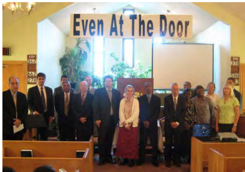
New Canadian Field Officers