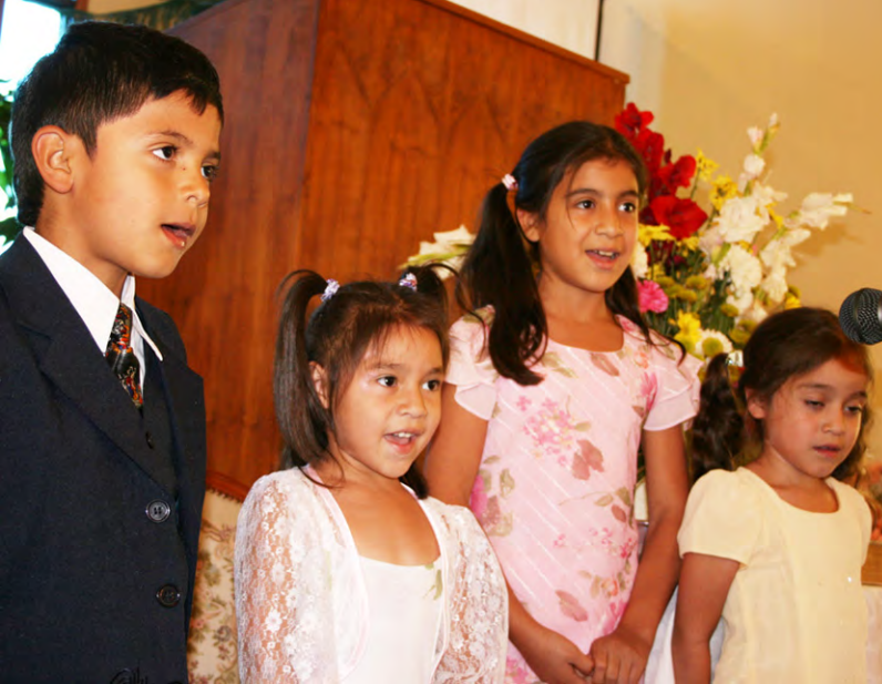
Children Special Song