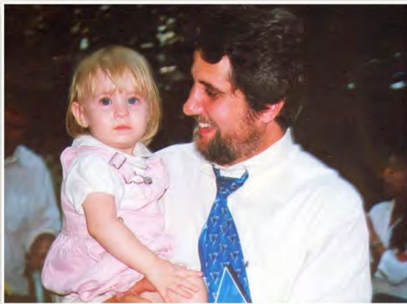
Canadian Field Conference