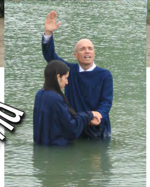
Baptism In London, Canada