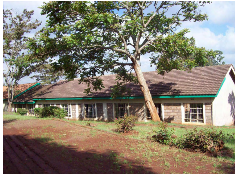
Church Primary School, Kenya