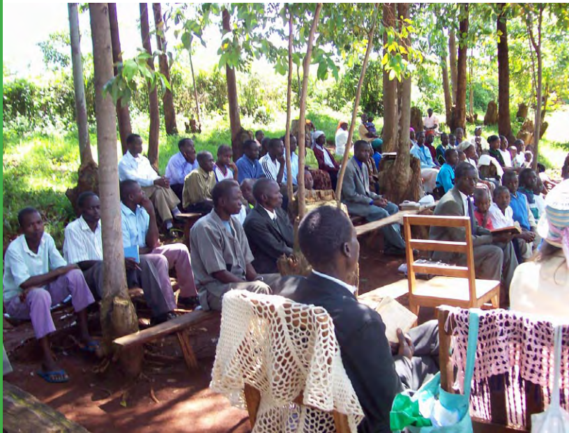
Church In The Woods, Kenya