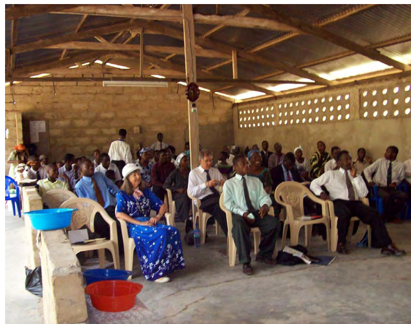
Church In Ghana, Africa