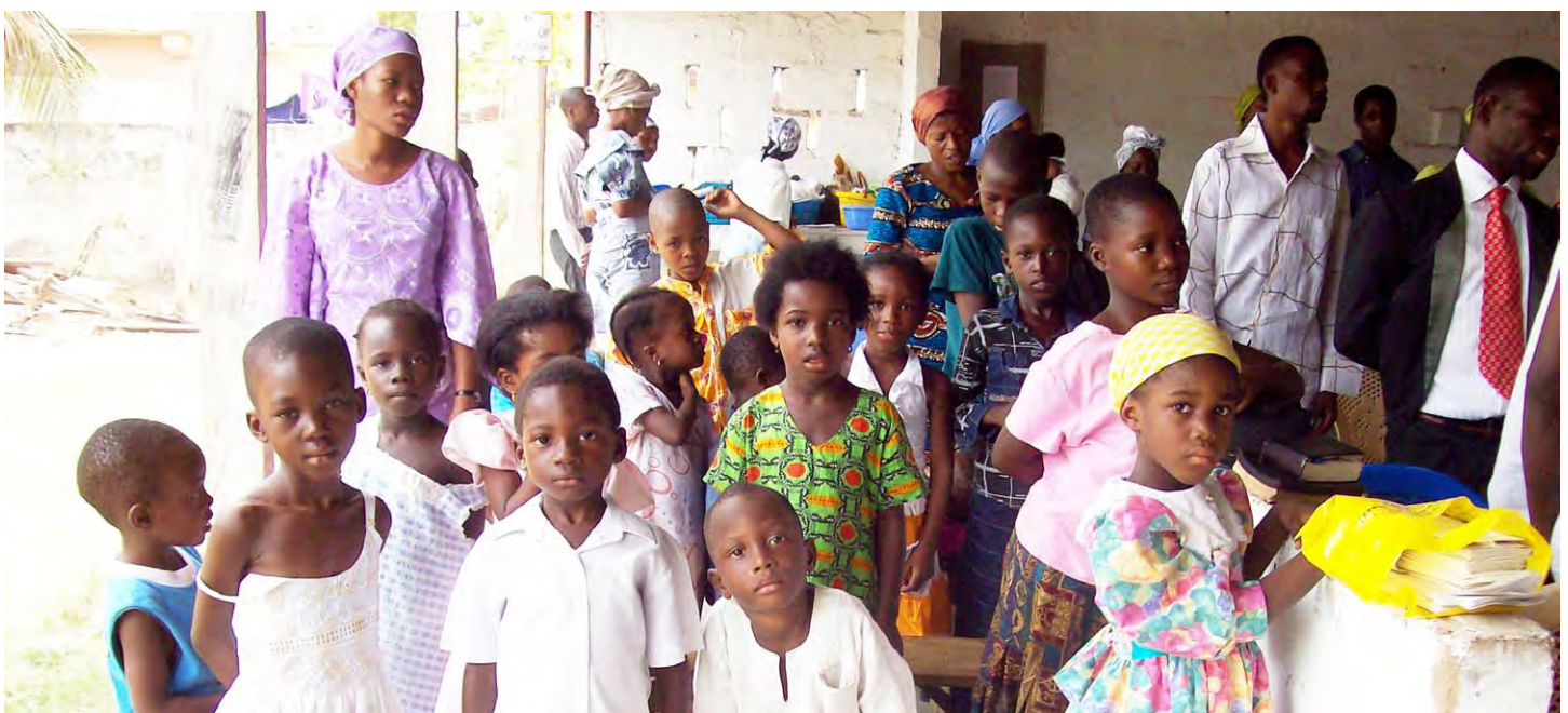
Group In Africa