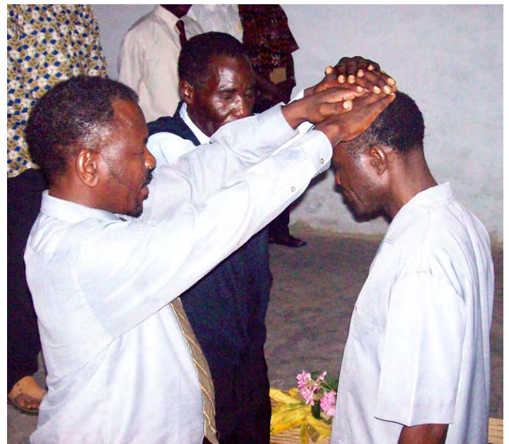
Ordination Of Elder In Ghana