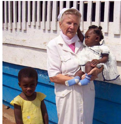
The Two Leilas In Ghana