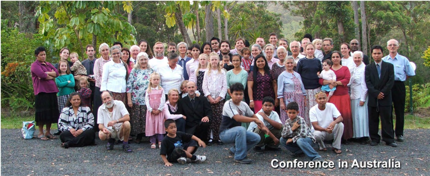
Conference in Australia