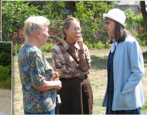
Canadian Conference 2007