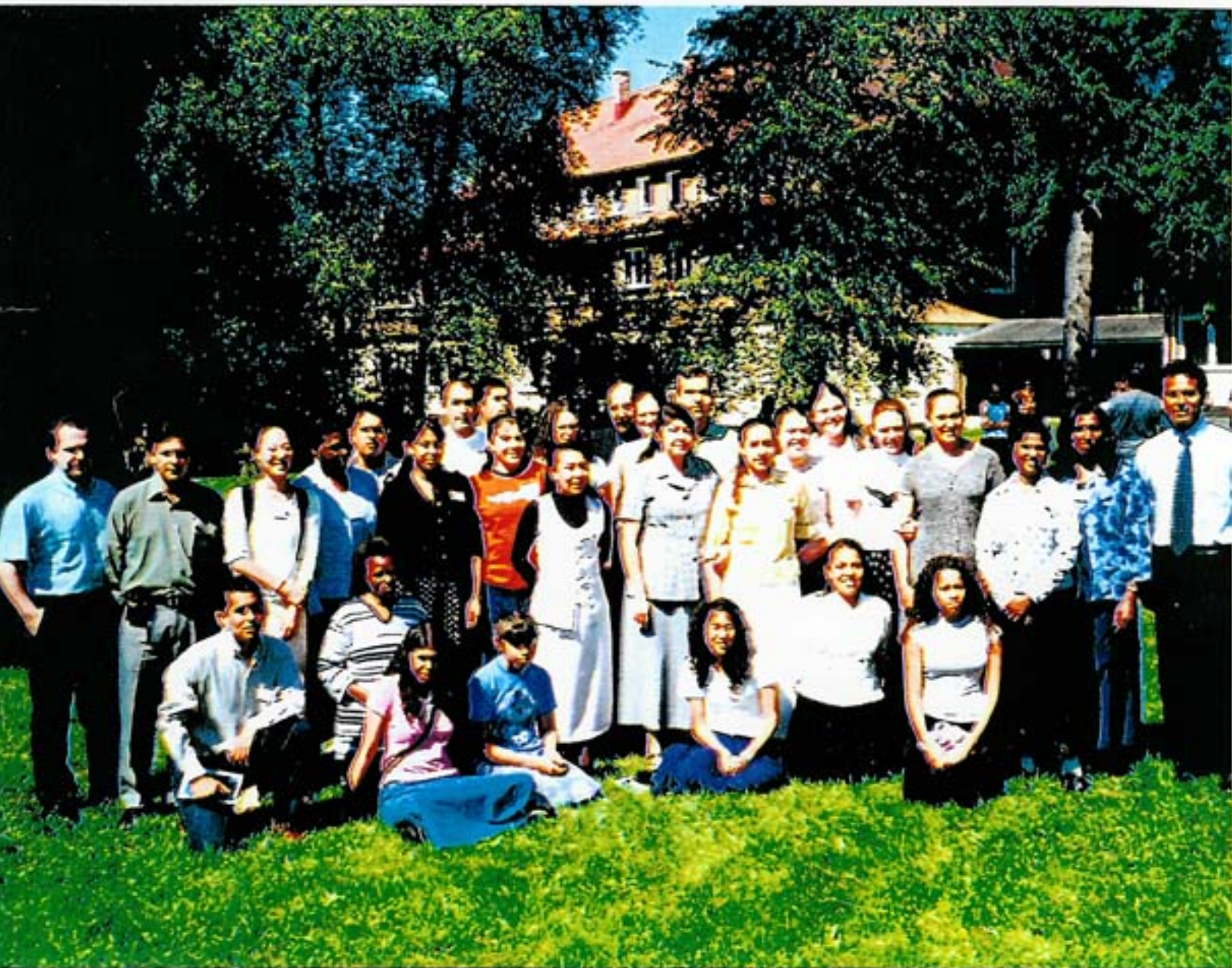
International Youth Conference Bonndorf – Germany, Aug.6-19

International Missionary Society of S.D.A. Church Reform Movement