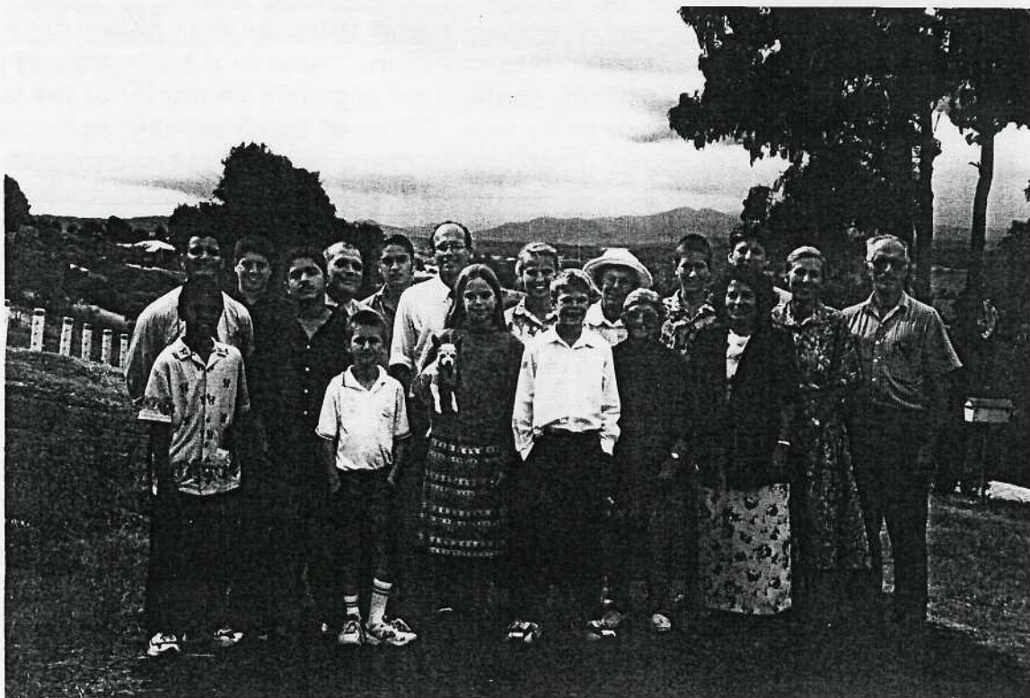
Members and Visitors in Queensland, Australia.