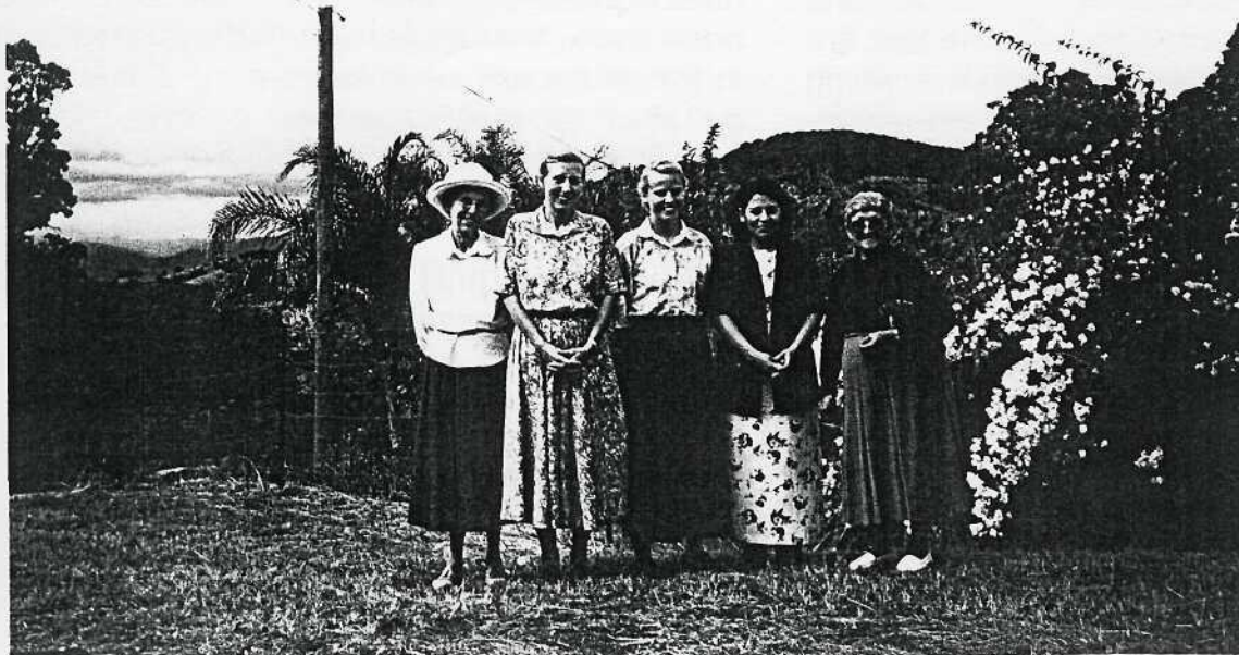
Sisters in Queensland, Australia