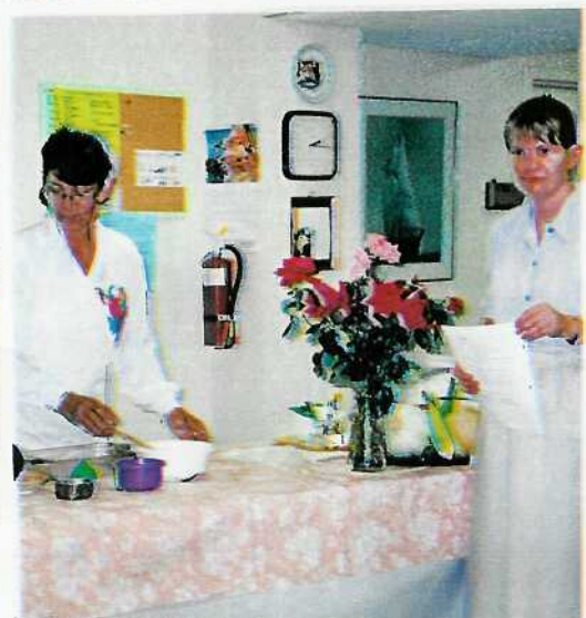
Cooking Class in London, Ontario, August 19.