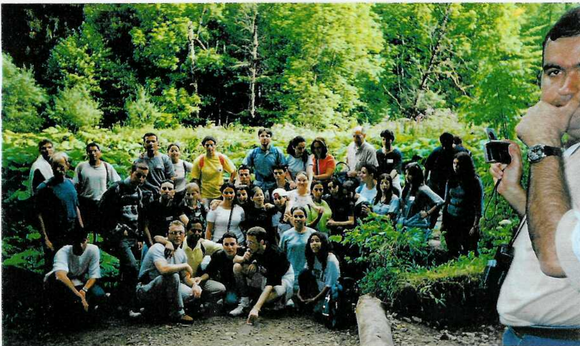
Young People taking a hike in the woods.