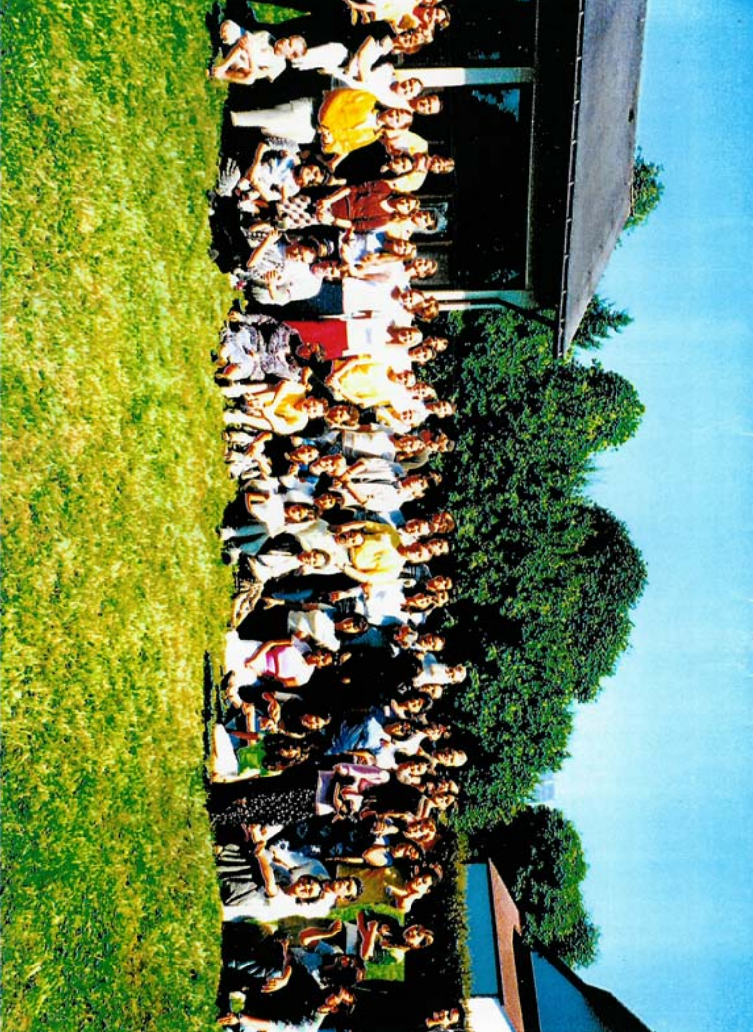
International Youth Conference