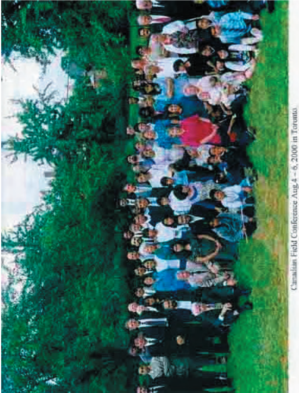
Canadian Field Conference Aug. 4 - 6, 2000 in Toronto