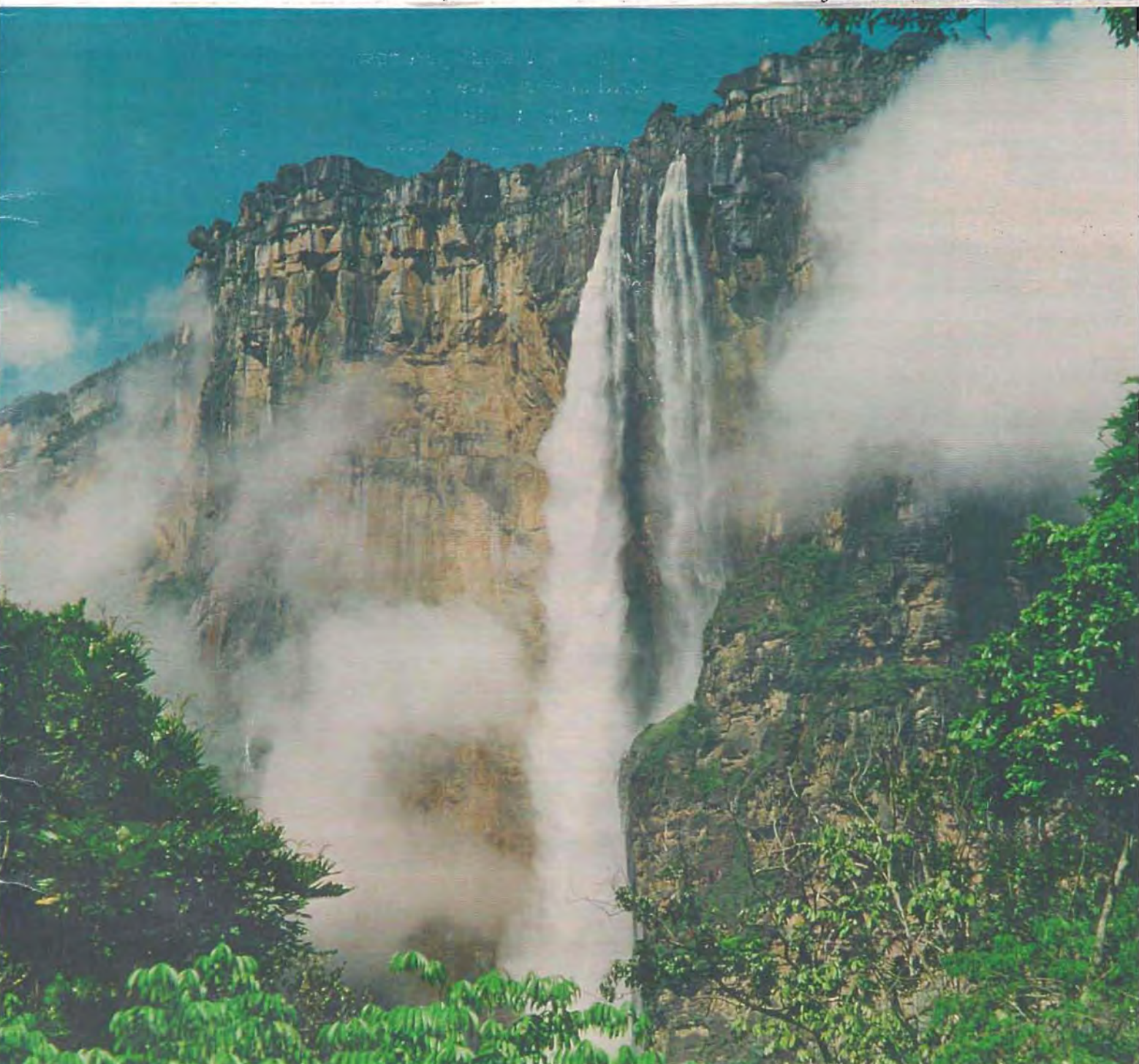
Angel Falls, Canaima, Venezuela

International Missionary Society of S.D.A. Church Reform Movement