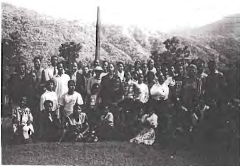
Group of believers and visitors in Montego Bay, Jamaica