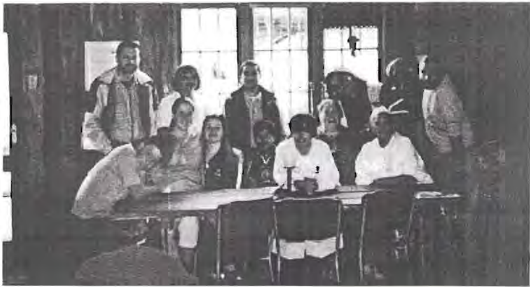
Australian Youth Conference

One mother of Israel came to me and said: "Dear child, have you found Jesus?" I was about to answer, "Yes" when she exclaimed: "Indeed you have, His peace is with you, I see it in your face!" Again and again I said to myself: "Can this be religion? Am I mistaken?" It seemed too much for me to claim, too exalted a privilege. Though too timid to openly confess it, I felt that the Savior had blessed me and pardon my sins.