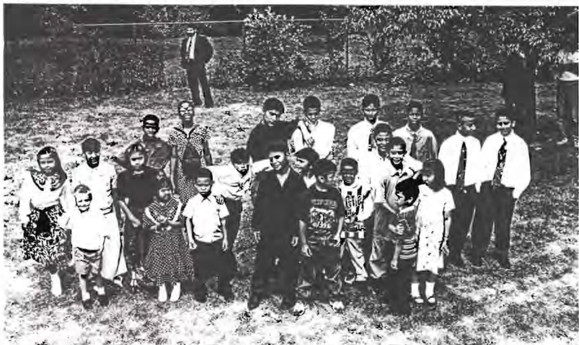
Some of the children at the Canadian Field Conference