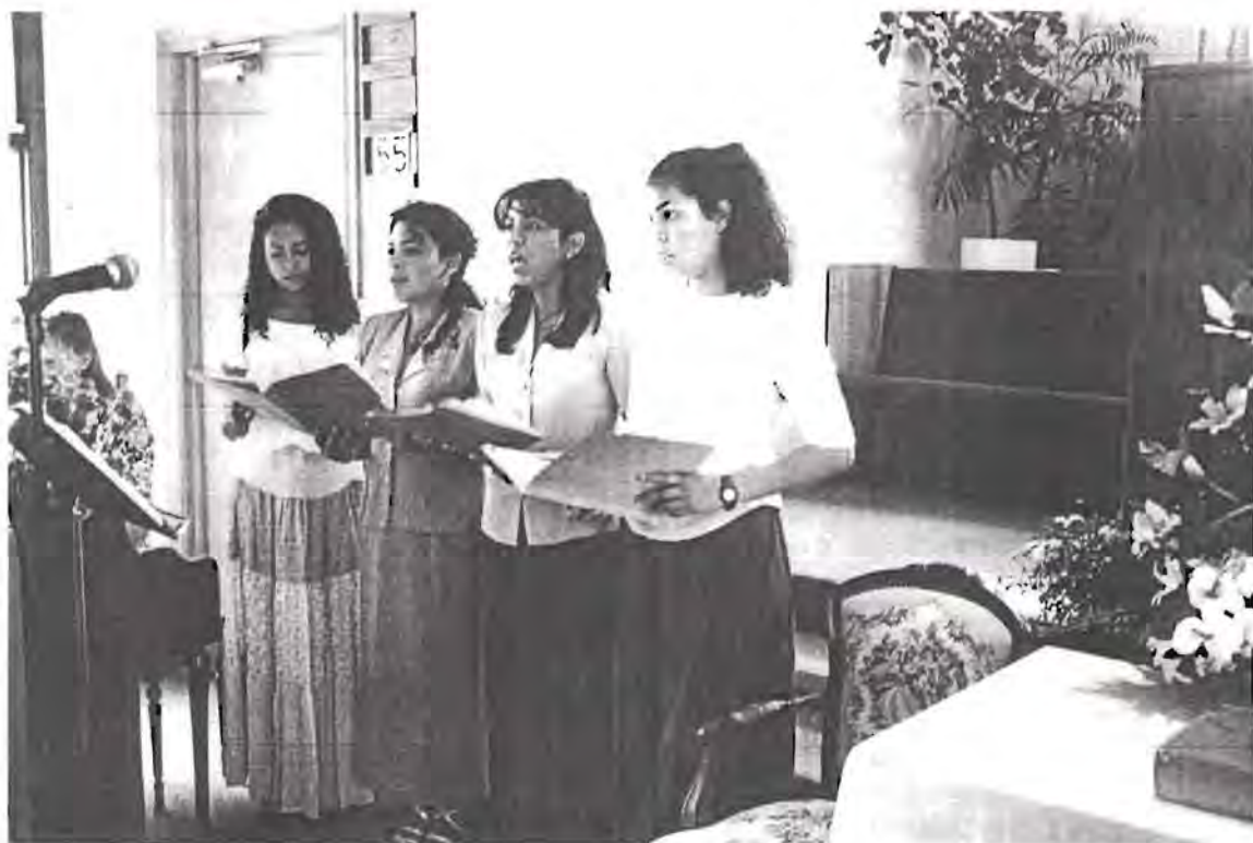
Singing at the Canadian Field Conference.

Use in cooking: Rice dishes, with lentils, cheeses.