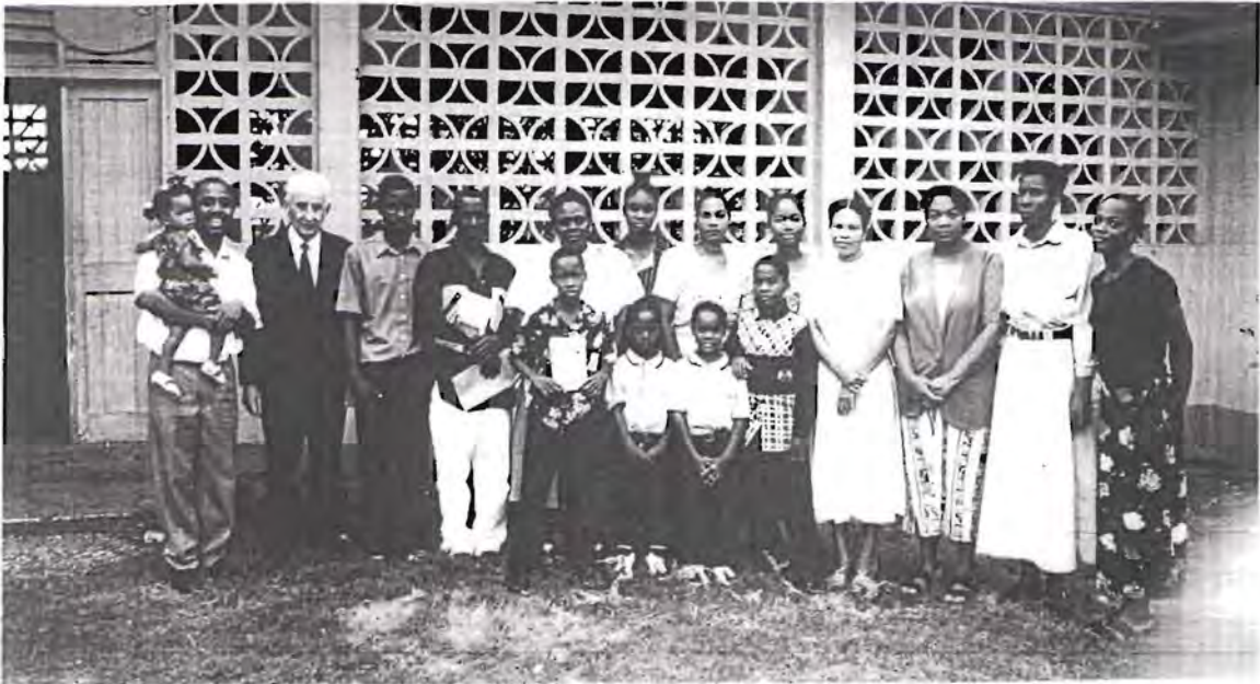
Montego Bay Church group

When whole wheat is stone ground it is crushed between two large, flat moving stones, so that the bran and germ remain. To produce stone-ground white flour, the bran and germ are extracted or sieved off after it has been ground. Stone ground flour tends to go rancid more quickly and should be stored in the fridge or freezer. Some bakers say it produces a sweeter bread than that created with roller-milled flours.