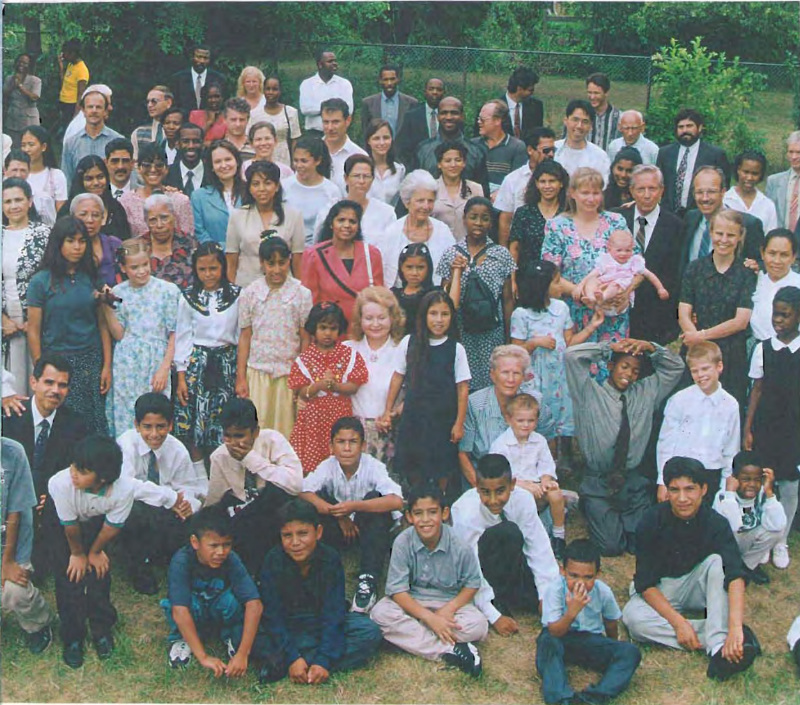
Some of the members and visitors at the Canadian Field Conference

International Missionary Society of S.D.A. Church Reform Movement