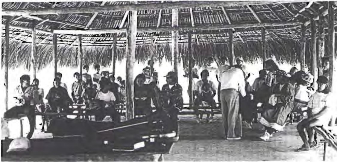
Sabbath meeting in Las Babas, Venezuela