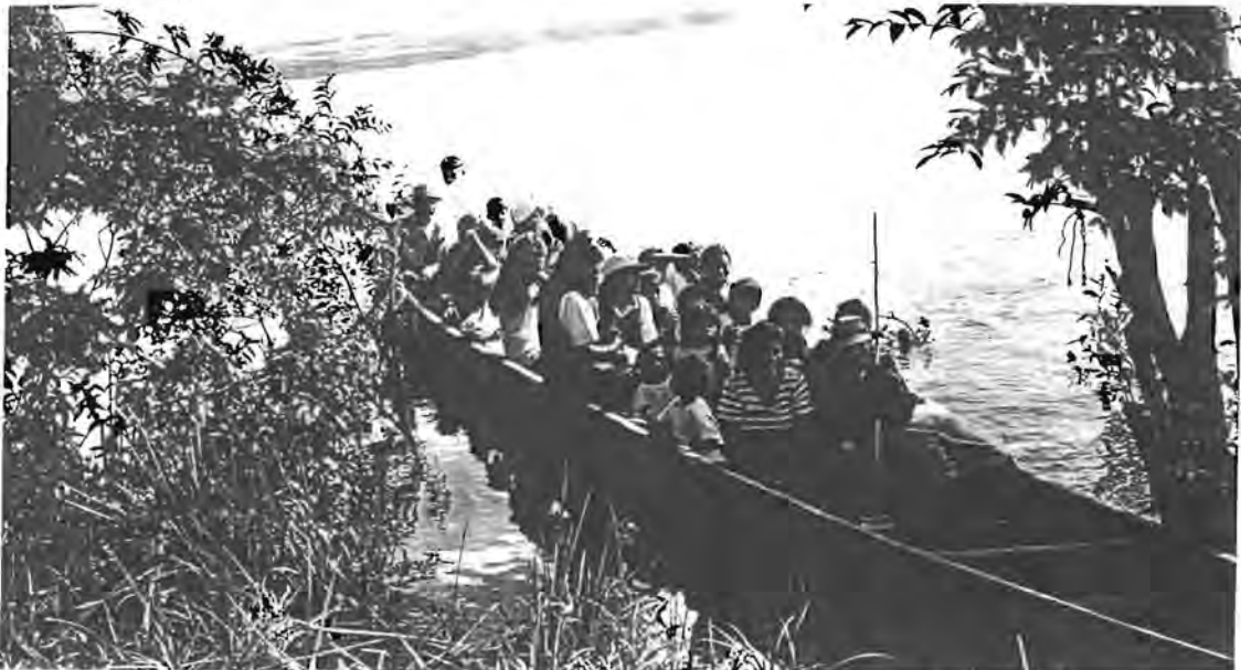
On the way to church in Venezuelan Jungle.