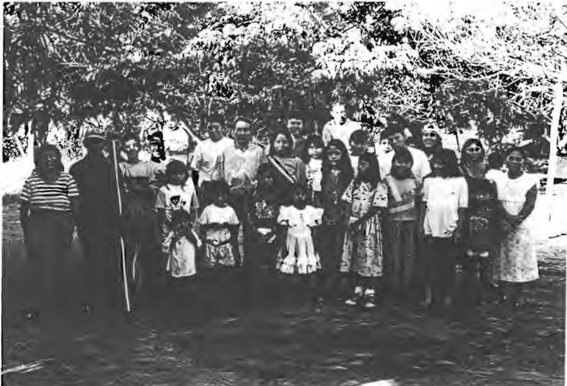
New believers in Venezuelan Jungle.