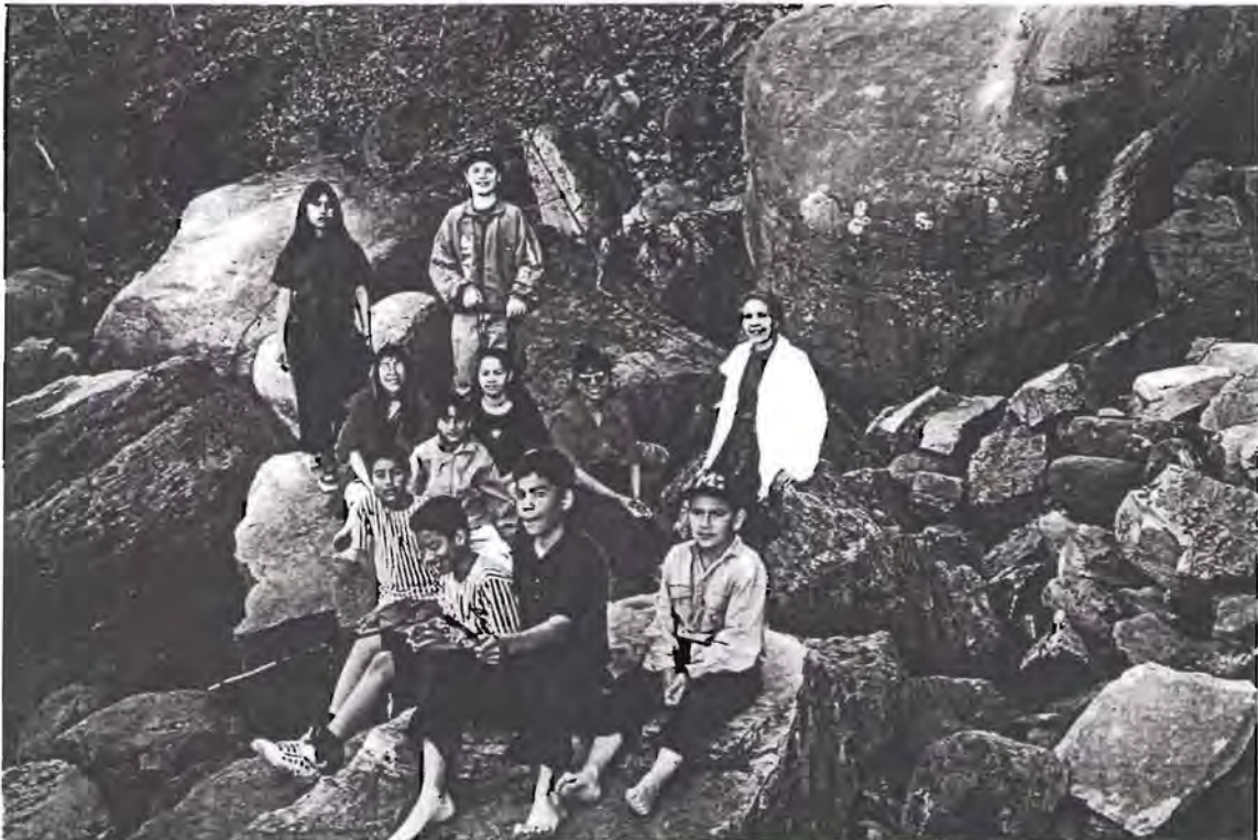
Relaxing after canvassing at Niagara river.