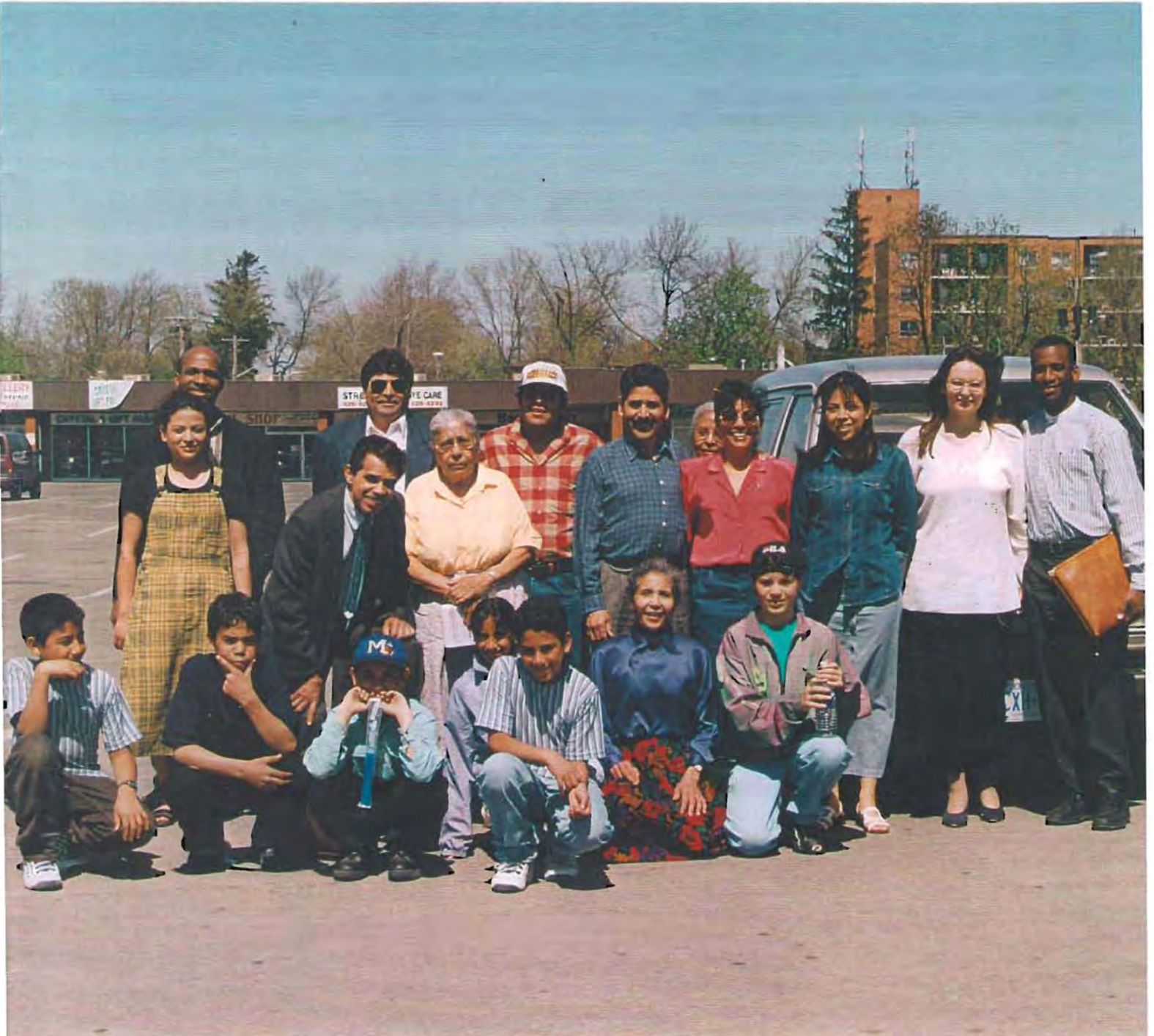
Happy canvassing group in Streetsville

International Missionary Society of S.D.A. Church Reform Movement