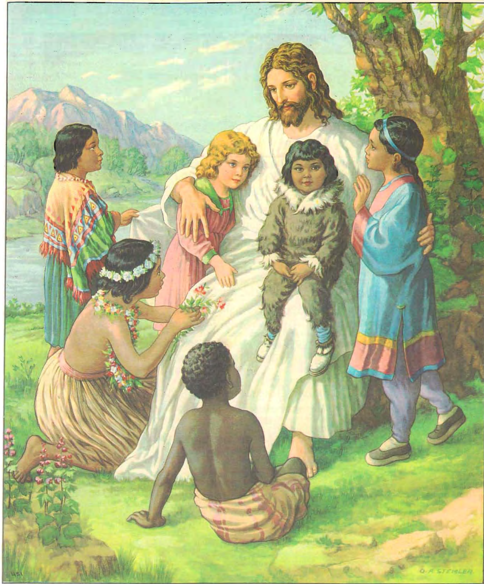
Jesus and Children of Many Nations