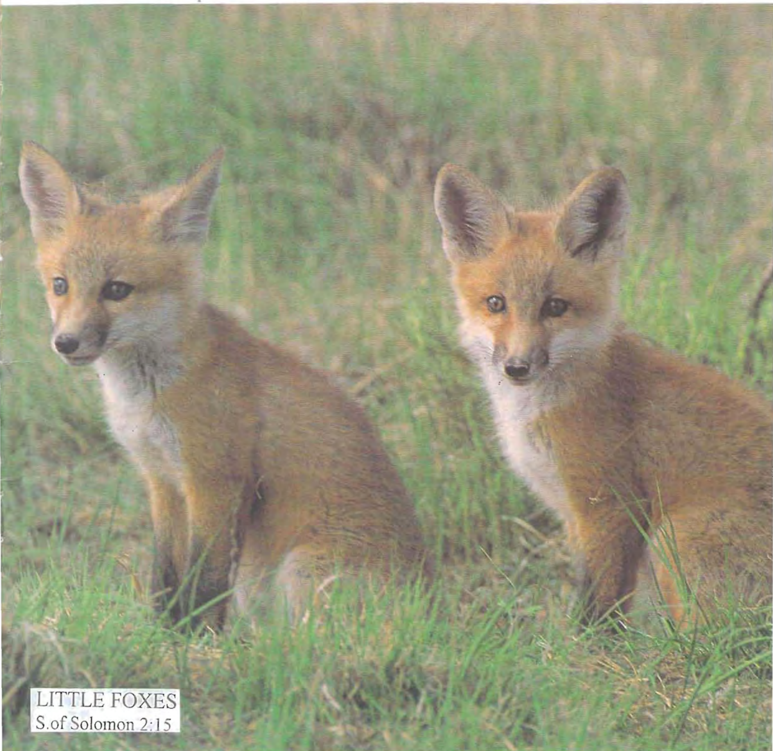
LITTLE FOXES S.of Solomon 2:15

International Missionary Society of S.D.A. Church Reform Movement