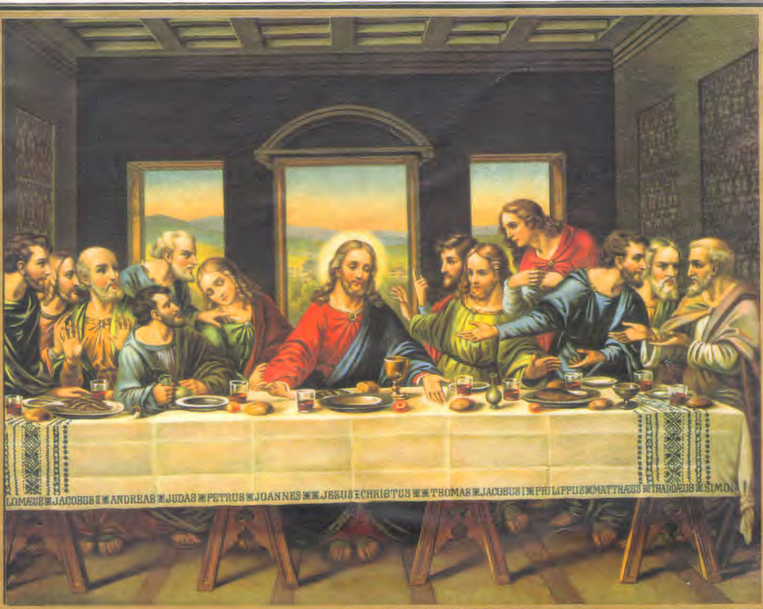
The Last Supper