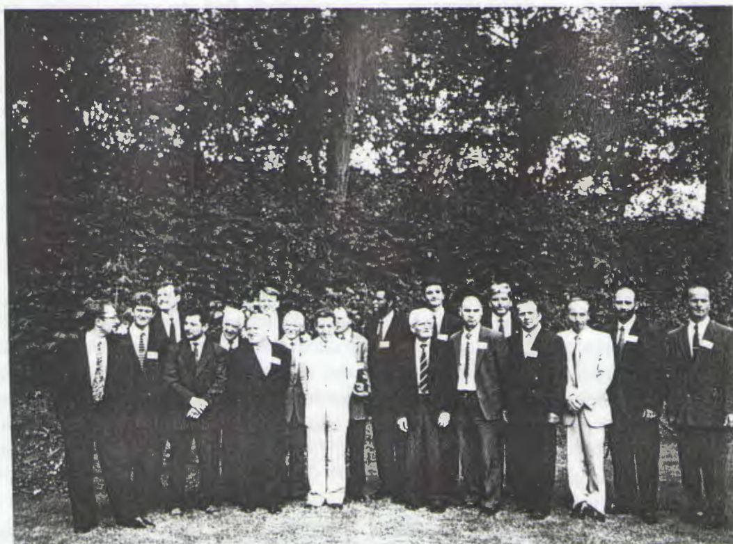
SOME OF THE 84 DELEGATES FOR THE GENERAL CONFERENCE