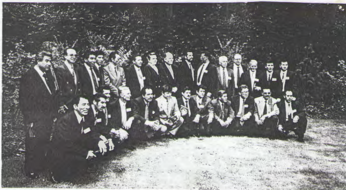
SOME OF THE 84 DELEGATES FOR THE GENERAL CONFERENCE

With the hymn, "God Be With You Till We Meet Again" and a benediction our conference was closed. AMEN