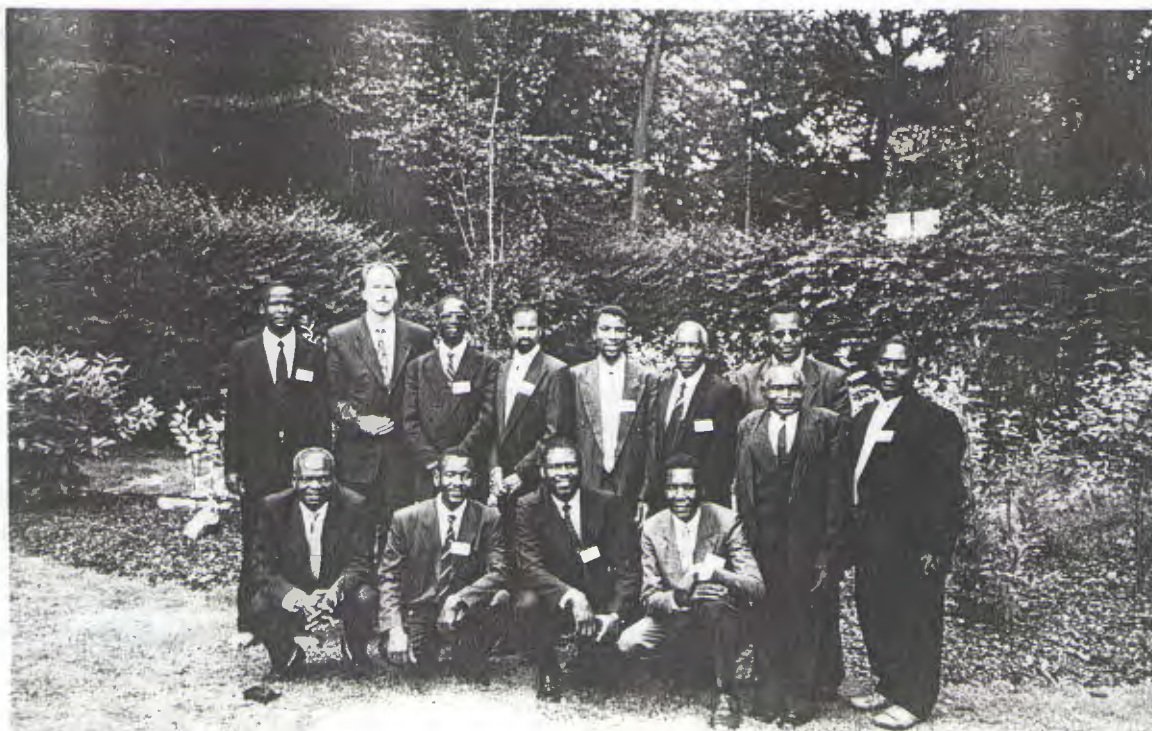
African Delegates to the General Conference