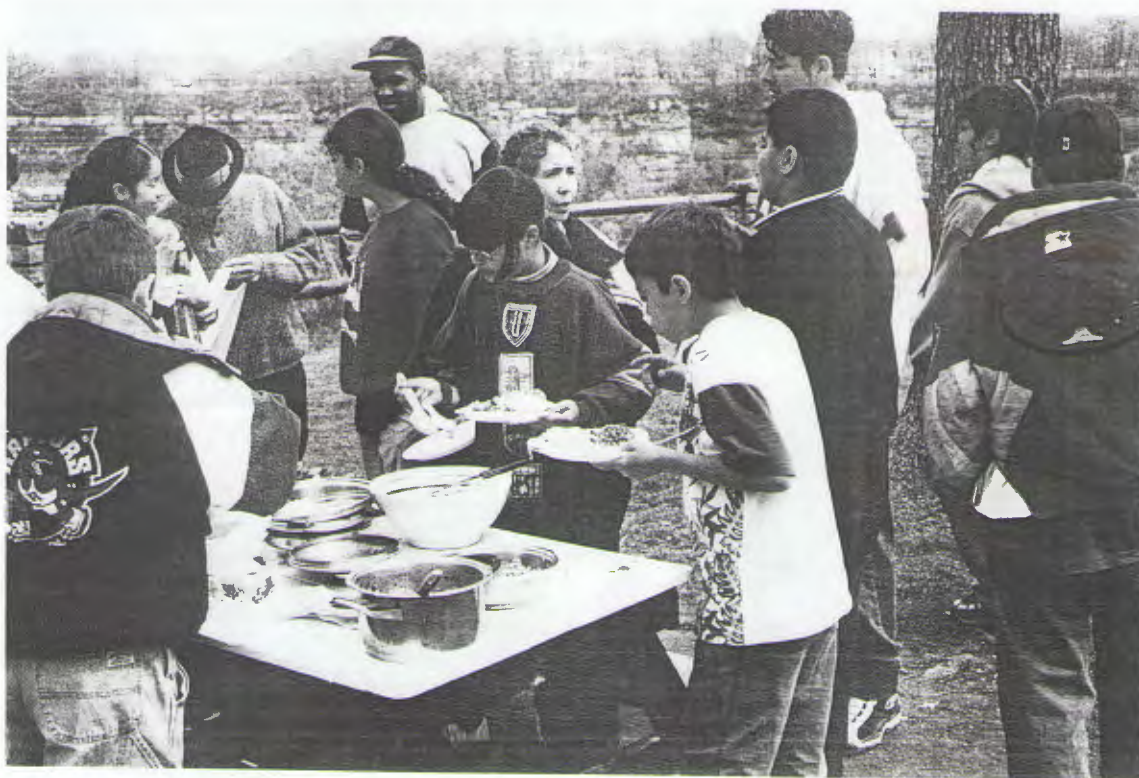
Streetsville Branch Sabbath School Outing at Niagara Falls

In a good health food store you can find books that advise certain vegetable or fruit juices that are beneficial to certain ailments. When the body is ill and not able to eat much, it is better to give the digestive system a rest and yet you can still obtain the much needed nutrients that your body needs to heal itself by making raw fruit or vegetable juices.