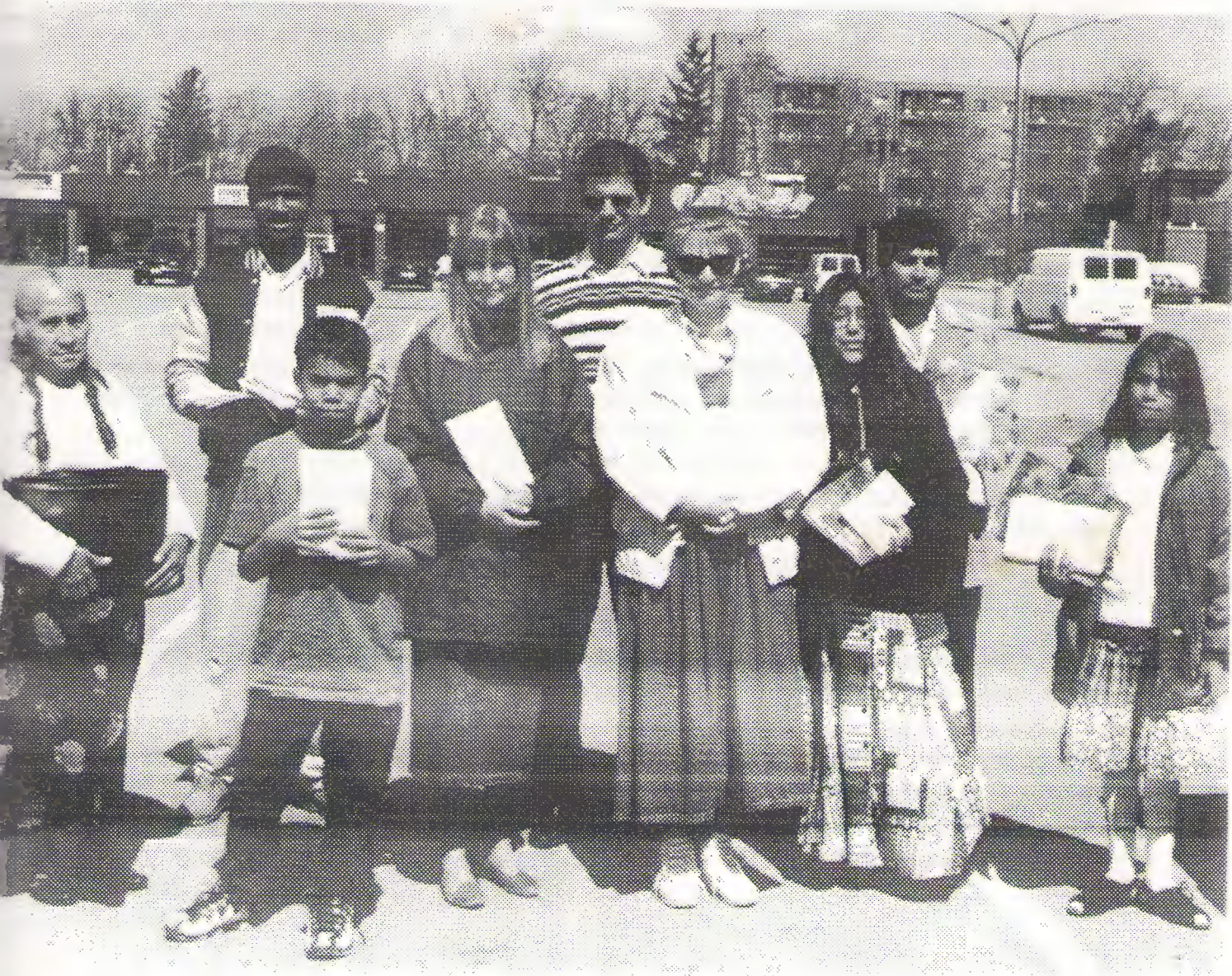
A Group of Canvassers in Streetsville