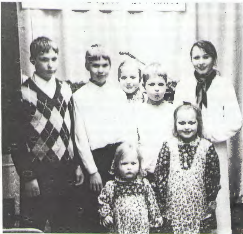
Children at the seminar