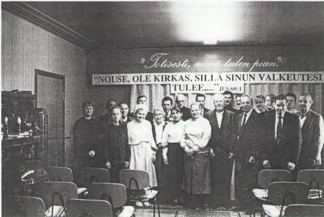
Some of the students.