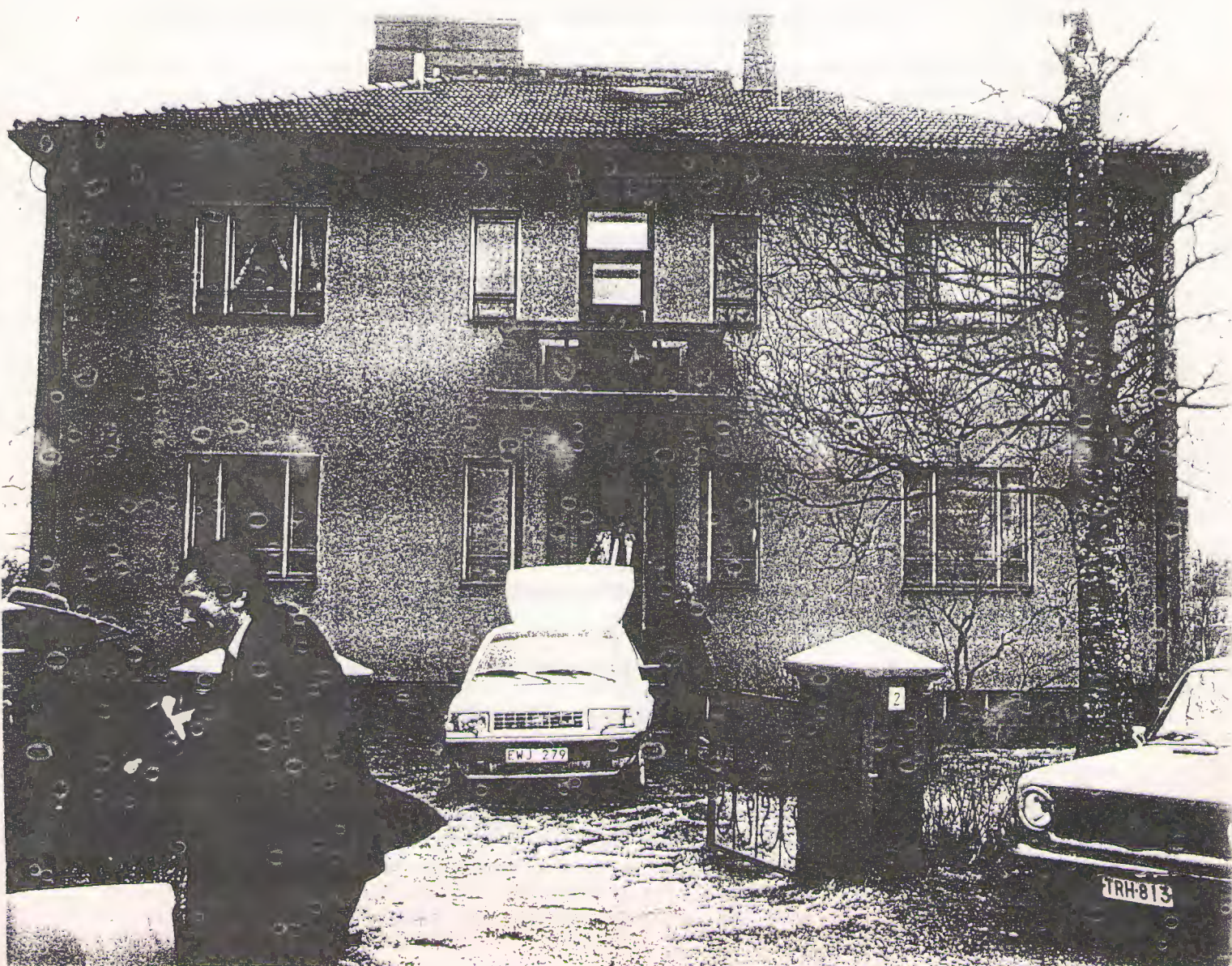
Mission House in Finland