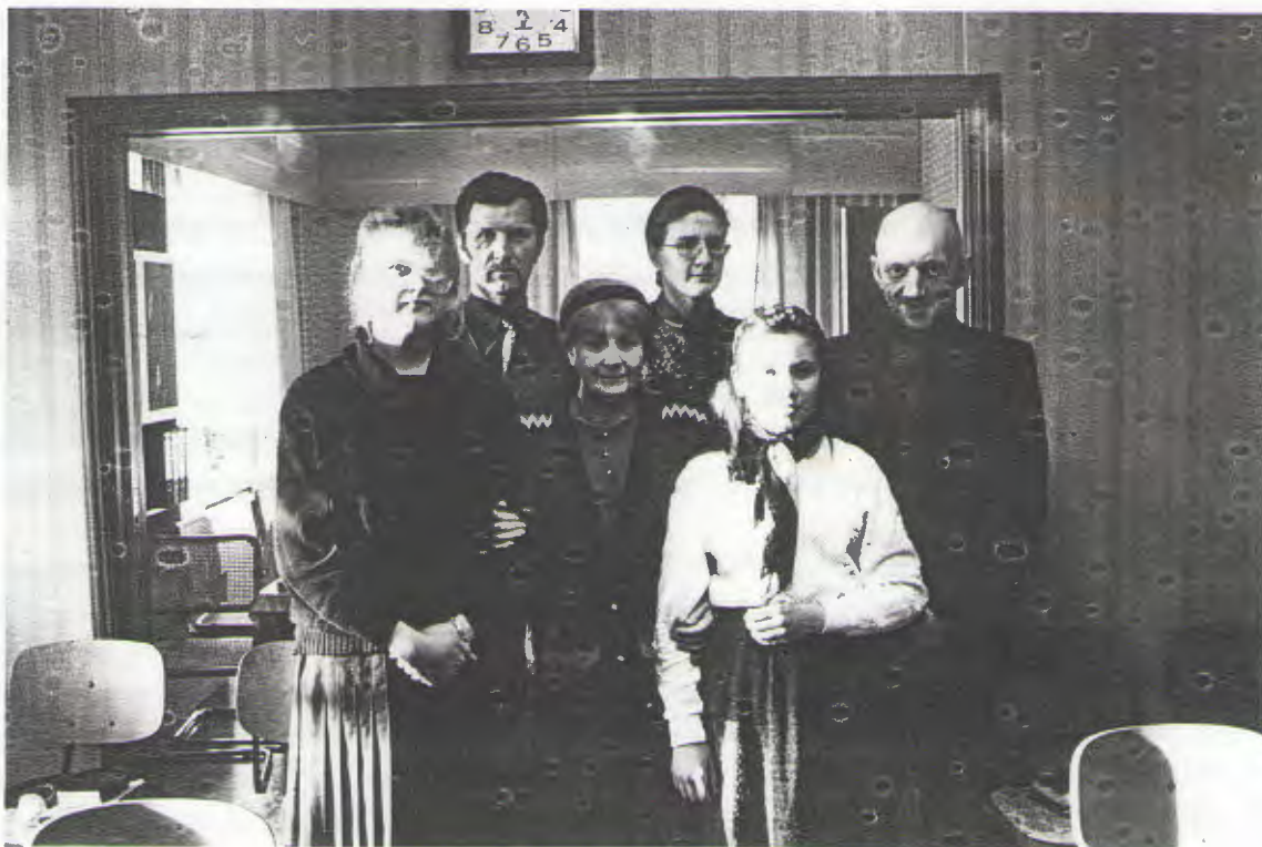
Visitors from Estonia