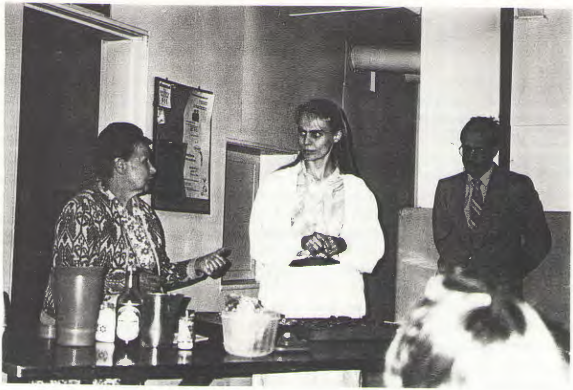
Cooking Class in Vancouver