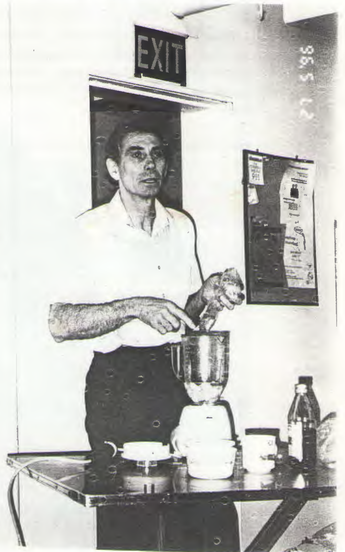
Angelus C. ...