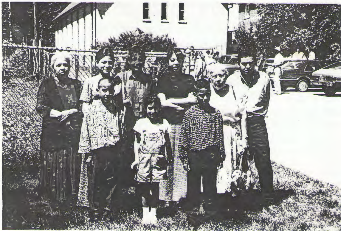
Family Urizar before leaving for Guatemala