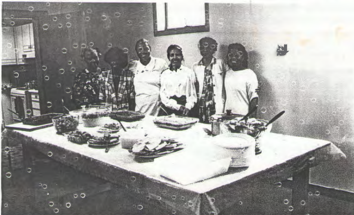
Participants of the cooking class in Toronto