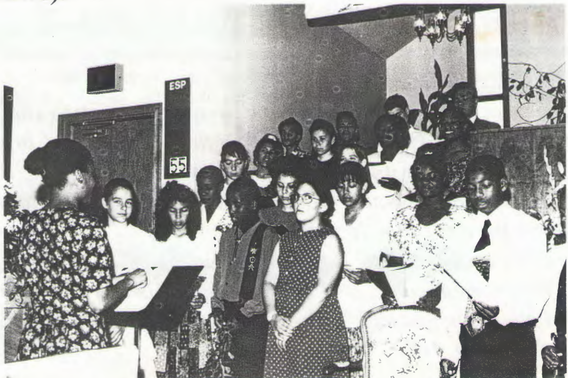
Canadian Youth Choir