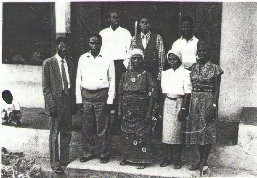
Eight Newly Baptized Souls in Ghana

Finally we can cry out: "Christ is all," as brothers Jones and Waggoner did at the 1888 Conference repeatedly. His grace is sufficient for us and supplies all our needs.