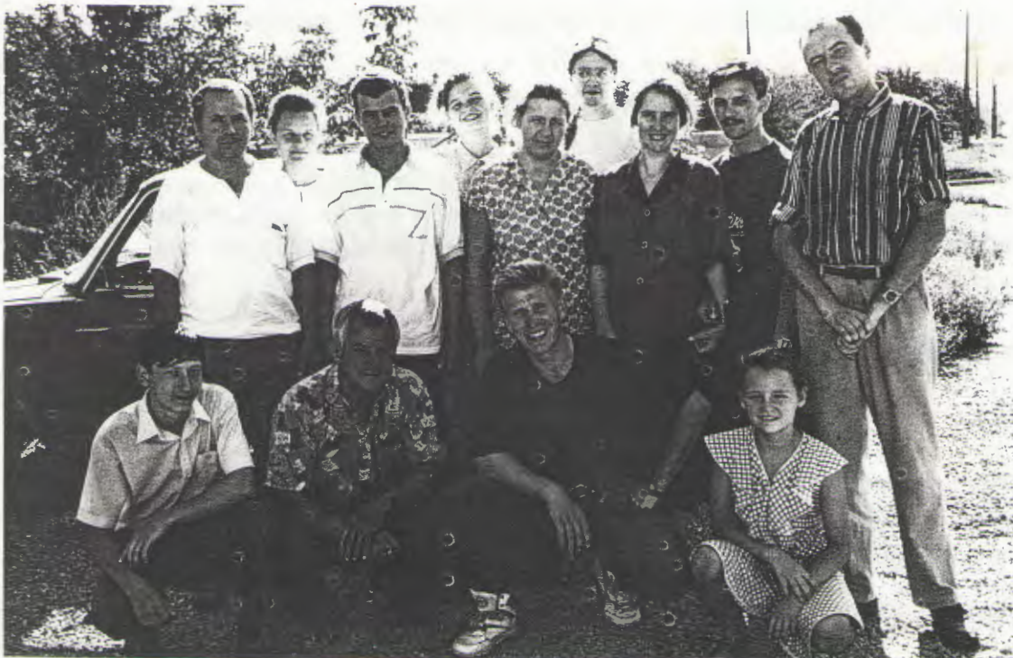
Believers in Russia

"The spirit of true fasting and prayer is the spirit which yields mind, heart, and will to God." CDF p. 189