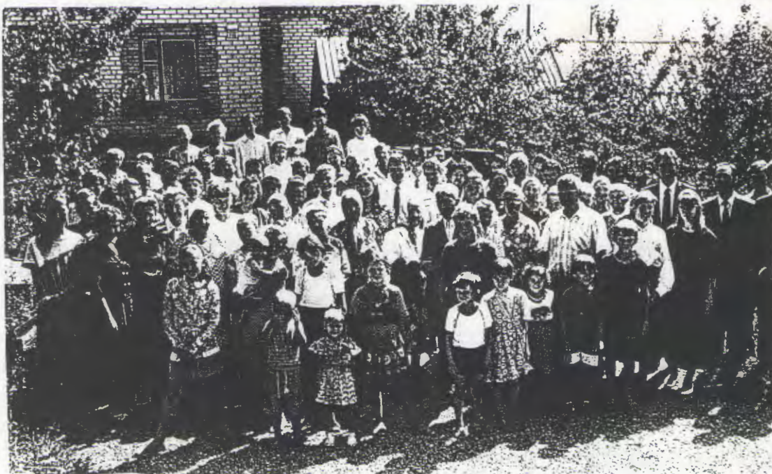
Members and visitors gathering at the meeting place before the Baptism in the Ukraine

“He disciplines His people that He may lead them in the right way.” Test. Vol. #5 : pg. 314