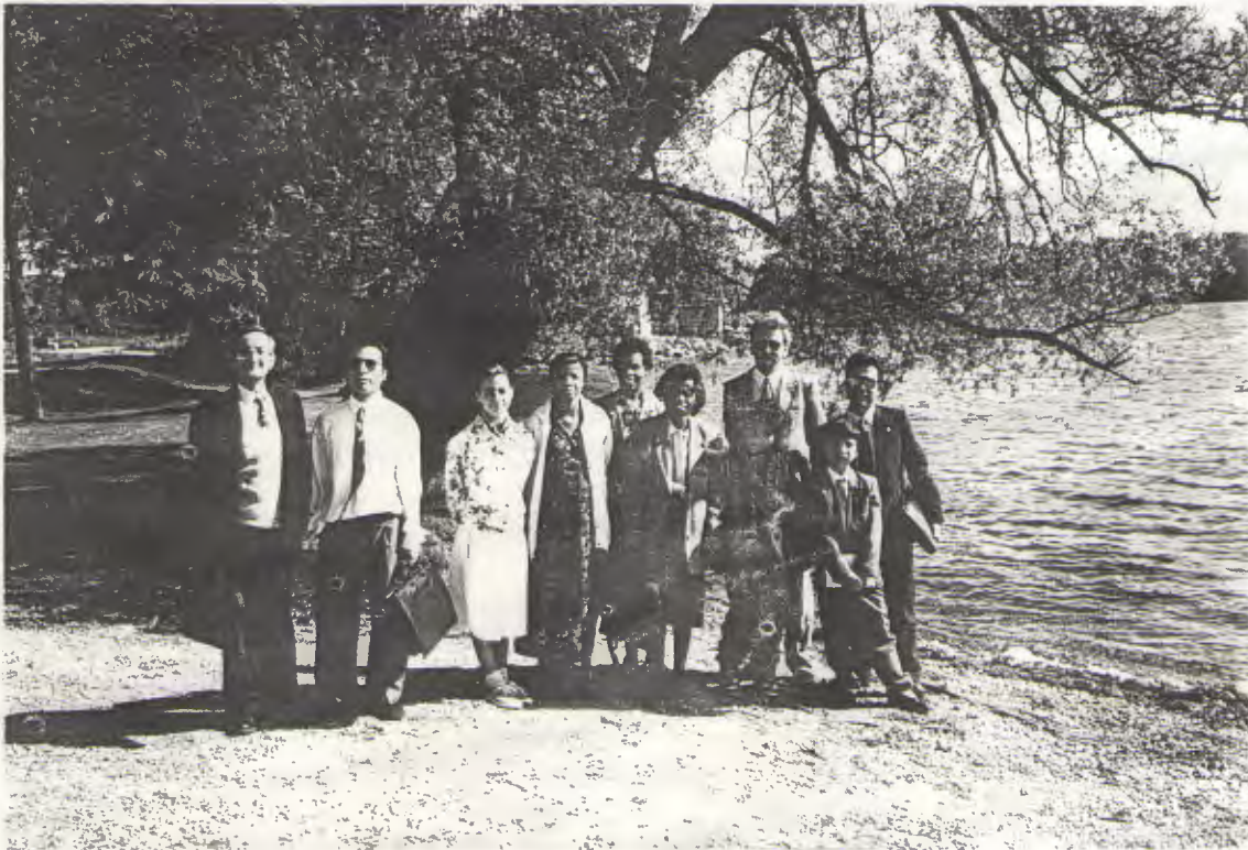
A Missionary & Canvassing Group in the City of Orillia