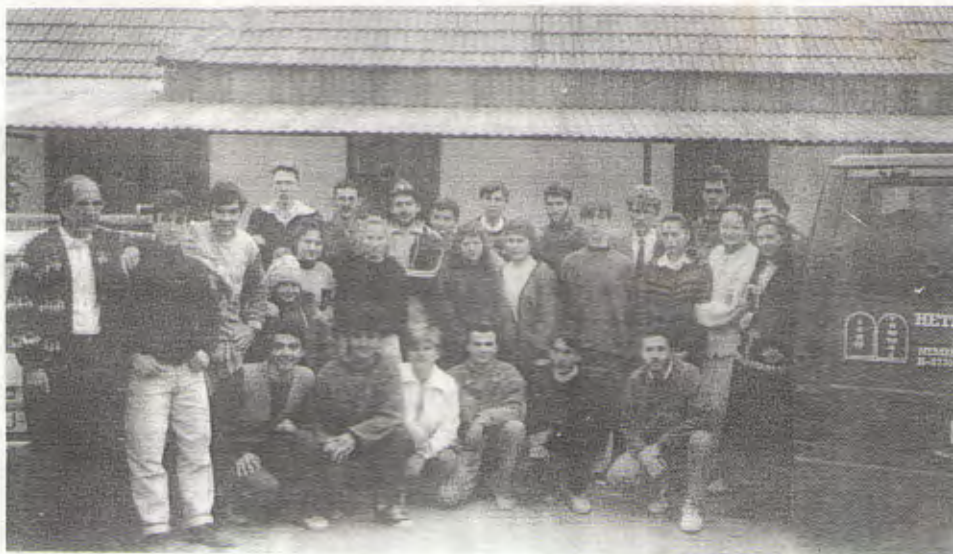
A Group of Students at our Mission School in Hungary