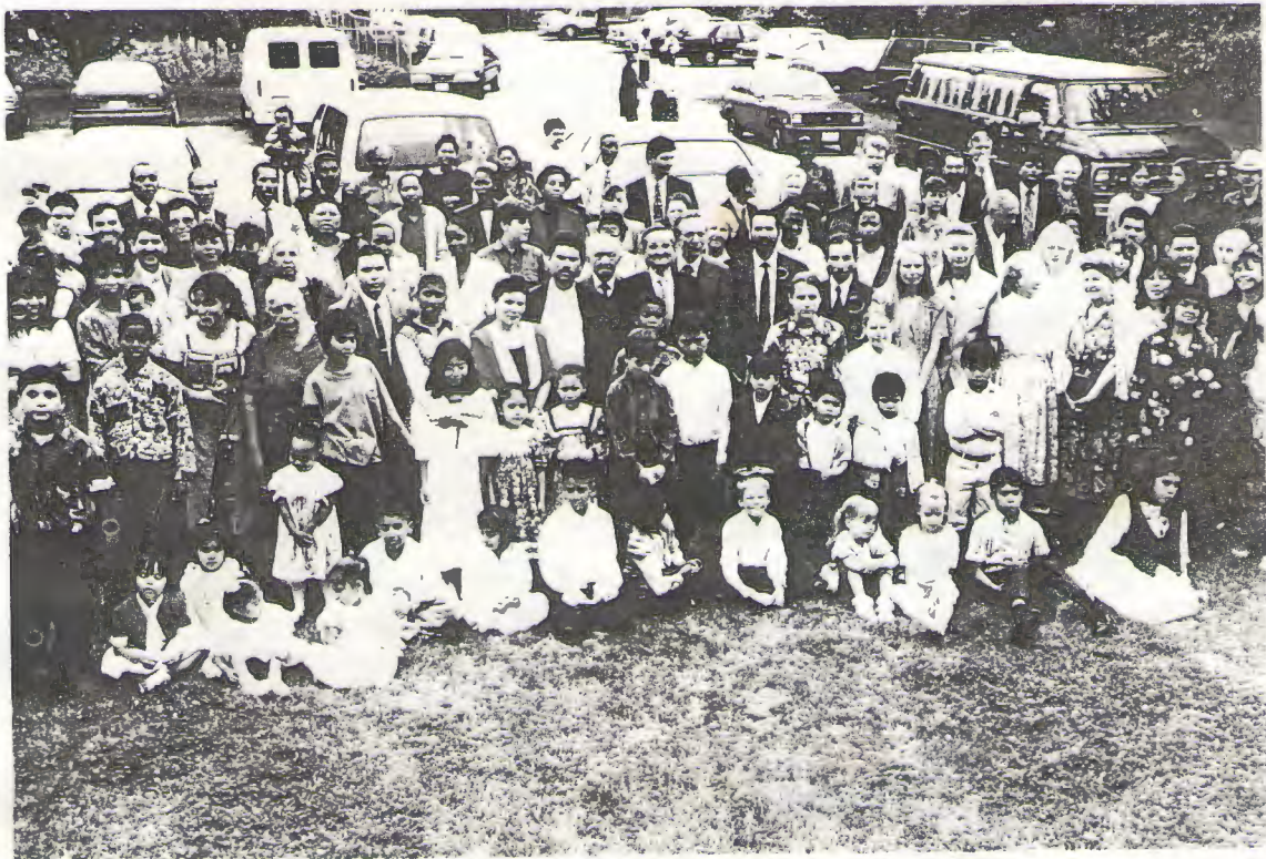
A Group at The Canadian Field Conference