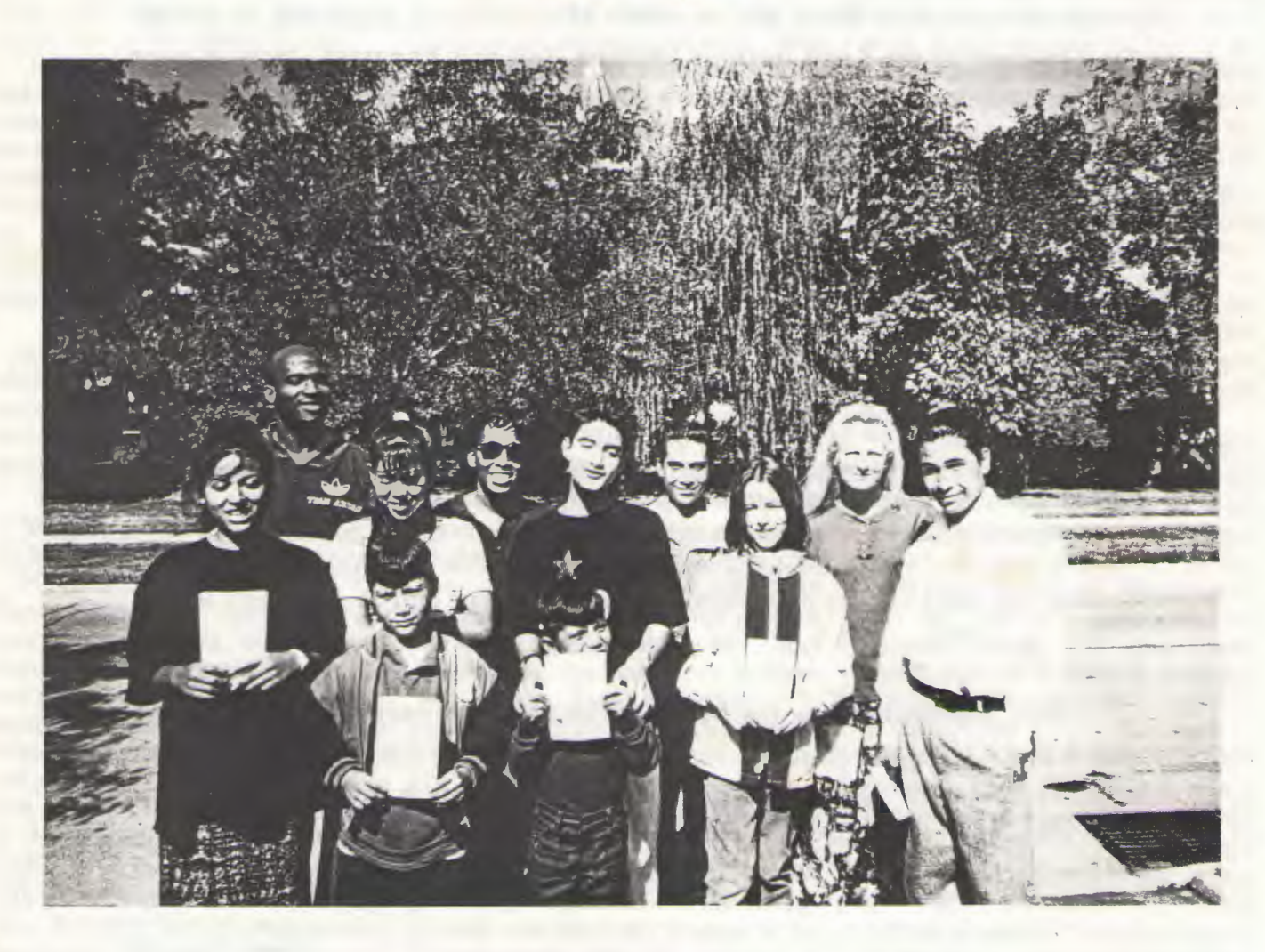
A Toronto youth canvassing group