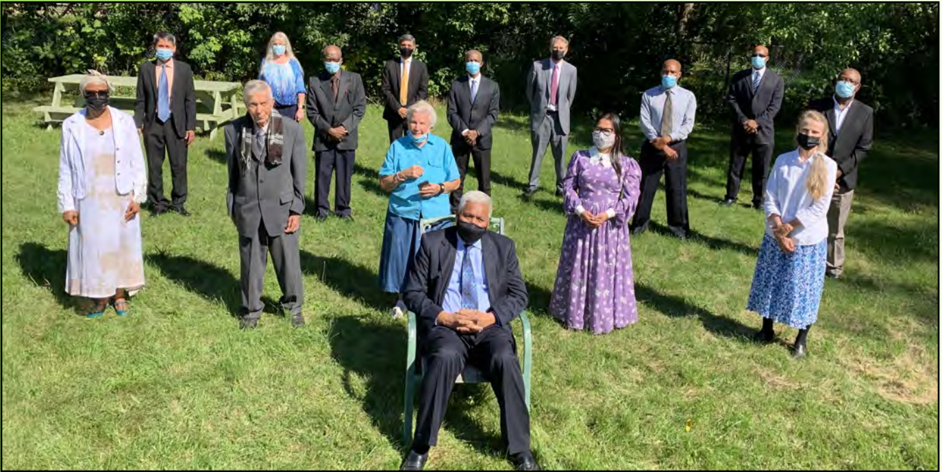
Canadian Field Delegates, September 2021