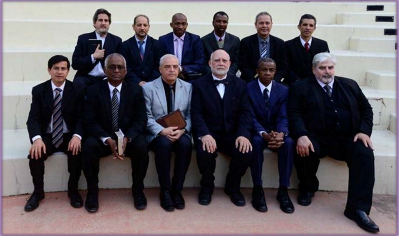
General Conference Committee